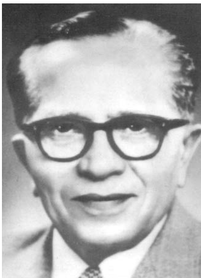
Dr. V. N. Shirodkar ( 1899-1971) (Figure 1)

In 1955, Dr V N Shirodkar described the cervical cerclage operation, a surgery which has stood the greatest test of all – time. He innovated special instruments for the repair of the incompetent cervix. (Figure 2) There have been a number of modifications, most notably that by McDonald, but