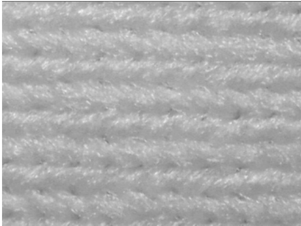
Face of Pure Zirconia Knit Cloth, Type ZOK-15