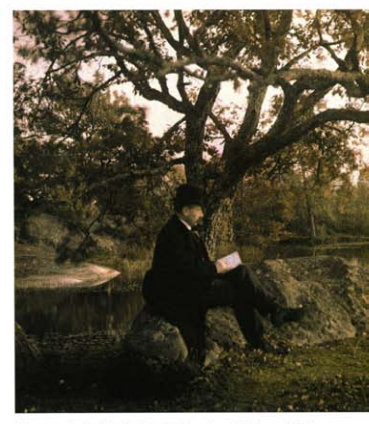
A man reads a book in the Fontainebleau Forest in France, 1910.