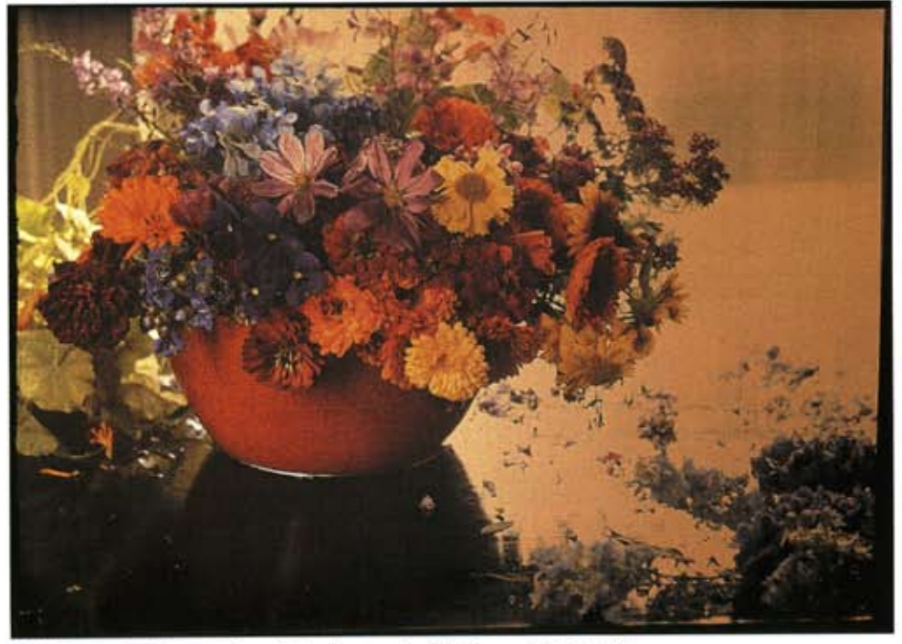
Still life study of flowers, circa 1908, photographed by Baron Adolph de Meyer. 24 Issue 2,2007

I have no medium that can give me colour of such wonderful luminosity as the Autochrome plate. One must go to stained glass for such color resonance, as the palette and canvas are a dull and lifeless medium in comparison.