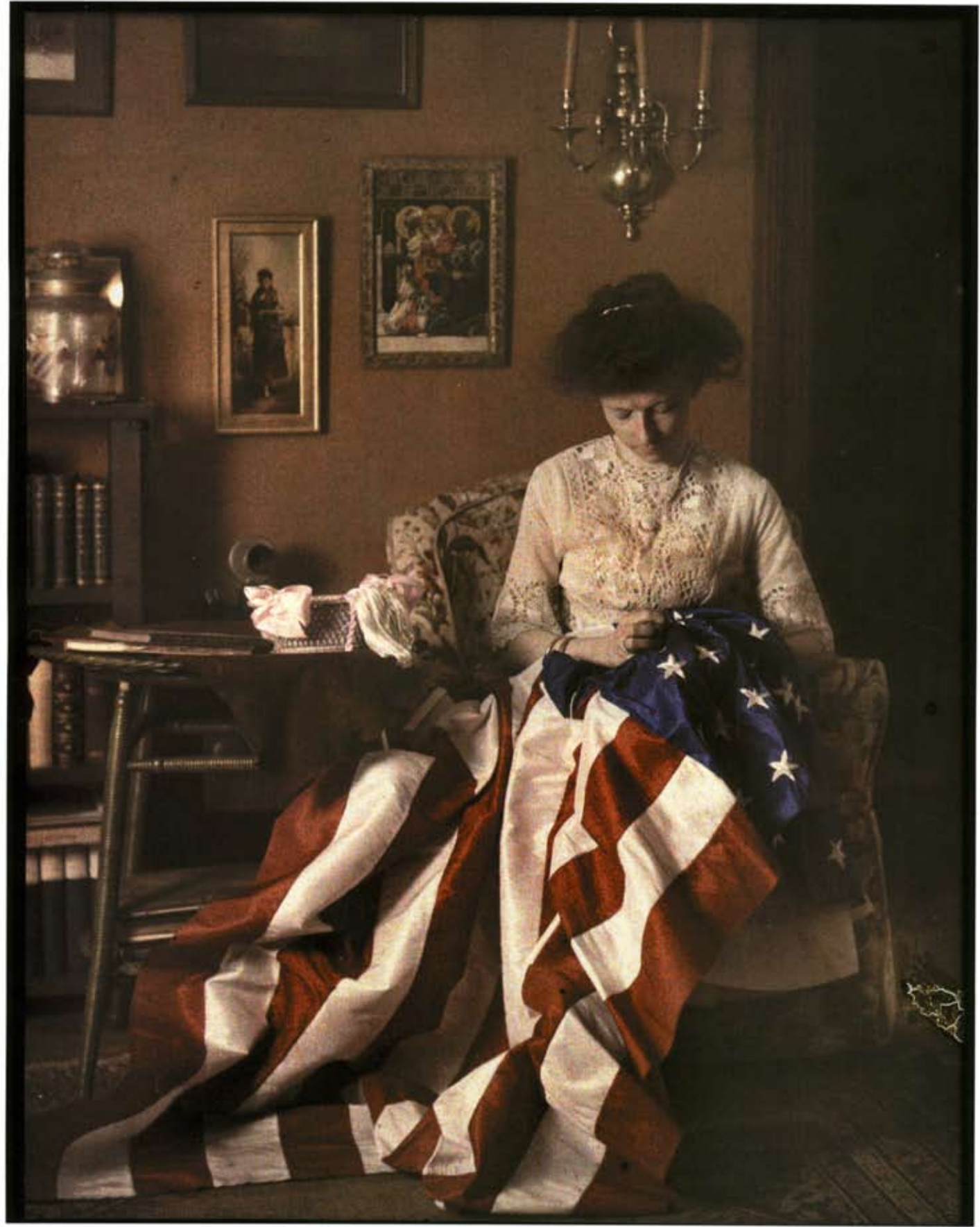
A woman sews the American flag, circa 1910