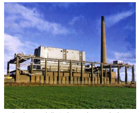
Development of effective hot gas cleanup technologies will allow for environmentally responsible utilization of coal for energy production

Benefits offered by nanocrystalline sorbents, including enhanced chemical kinetics and increased removal capacities, have been demonstrated for many toxic chemicals and pollutants. Similar effects are expected for sulfur and nitrogen compounds. Equally important, the approach proposed by NanoScale utilizes manufacturing methods that are easily scalable, cost efficient, and environmentally friendly. This distinguishes NanoScale's approach from other groups that study nanocrystalline materials and frequently use bench top synthesis methods that cannot be easily scaled-up to industrial scale. Some of these approaches, like sol-gel synthesis or vapor deposition methods, are too costly to be commercially viable in large scale industrial settings. Materials proposed for testing in this proposal do not require use of such expensive manufacturing processes.