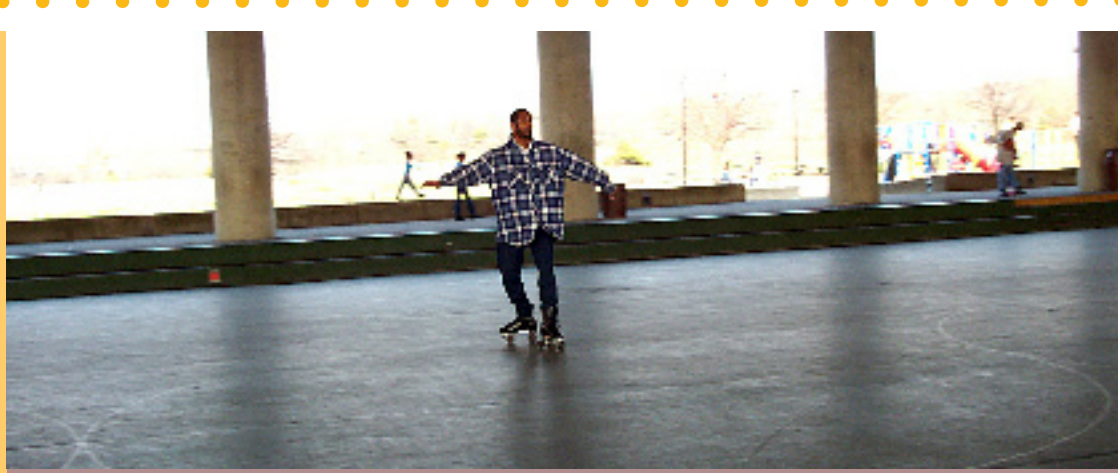
Skating at the pavilion in Anacostia Park, Washington, D.C.