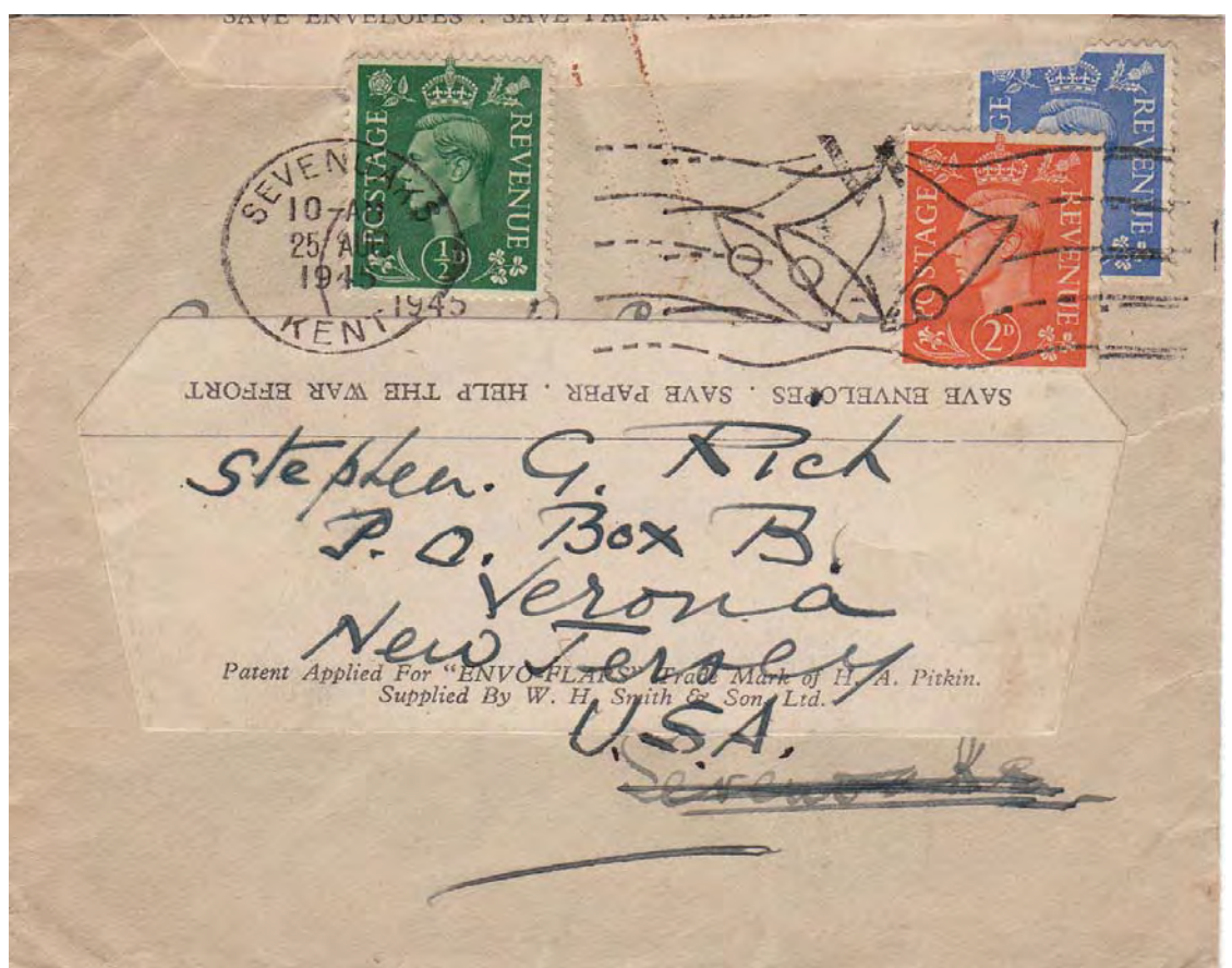
And, with VJ day in August 1945, the slogan became commemorative.