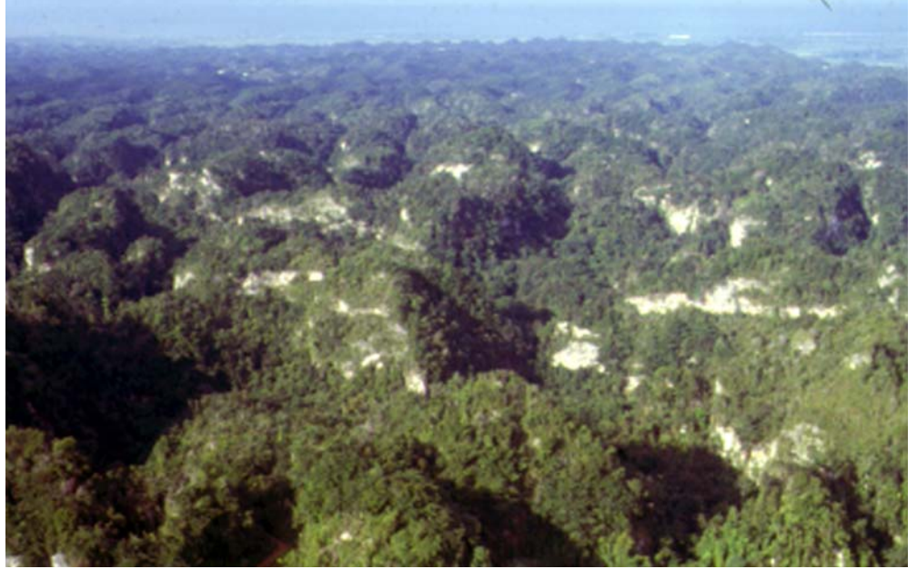
Haystack hills of northern Puerto Rico.

Puerto Rican karst covers more than one third of the island's territory. It is divided into two major regions: the northern karst, which is located primarily in the subtropical moist forest life zone and the southern karst located primarily in the sub tropical dry forest life zone.