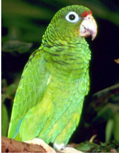
The endangered Puerto Rican Parrot (Amazona vittata).

The karst region harbors the richest biodiversity in Puerto Rico. More than 1,300 species of plants and animals are present in the karst. It is prime habitat for most of the native and endemic species of wildlife, including 30 federally listed threatened and endangered species. Many of these species are only known from karst ecosystems. More than 75 species of Neotropical migratory birds use the karst as wintering habitat.