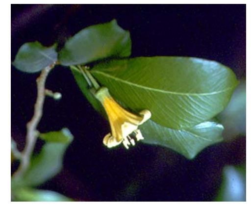
Goetzea elegans, typically found on mogotes.

Coordinator for Private Lands Conservation Program in the Caribbean U.S. Fish and Wildlife Service Caribbean Field Office, PO Box 491 Boquerón, PR. 00622-0491