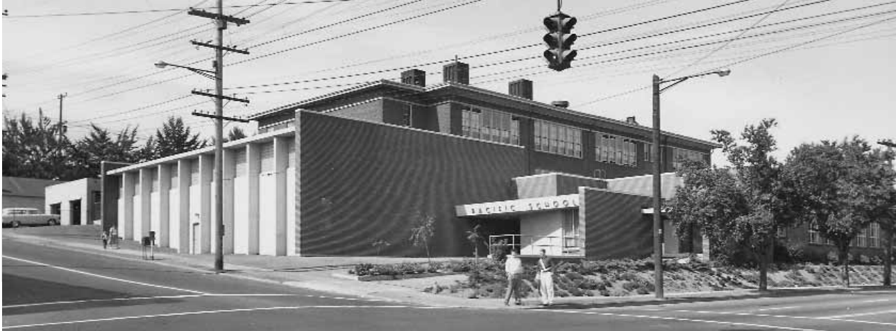
Pacific, 1958

learned cooking, baking, sewing, and nursing skills, while boys studied carpentry, metalwork, automotive repair, and care of livestock and poultry. Most of them graduated into jobs for which they were already trained. Some students went on to graduate from Garfield High School. In 1950, over 300 pupils and 20 teachers were housed in Pacific, and one-third of the population was non-white.