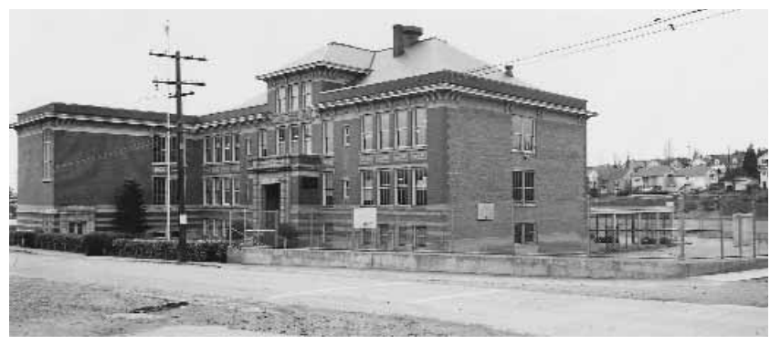
Ravenna, ca. 1960

The building was sold to the city and since 1986 has housed the Ravenna School Apartments for seniors on its upper floors, along with a senior center and community center on its lower level. Once sold to the city, the structure was eligible for federal funds, which were used to construct a new Seattle Parks Department gymnasium and a senior center.