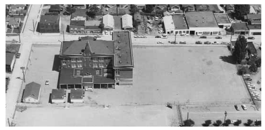
Ravenna, 1960 SPSA 265-112

The playfield gained even more space in 1950 with additional land to the south. That year, the school reached its peak enrollment of 768 students.