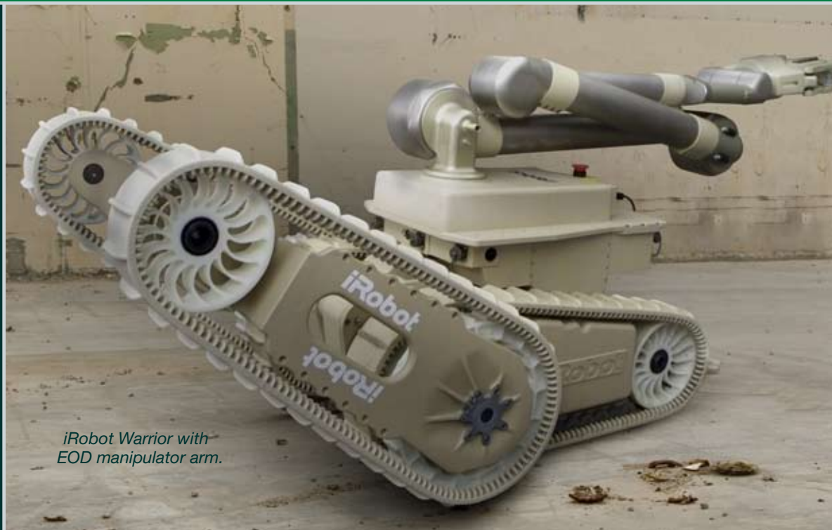
iRobot Warrior with EOD manipulator arm.

Powerful and rugged, the iRobot Warrior is a multi-mission robot that carries heavy payloads, travels over rough terrain and climbs stairs.