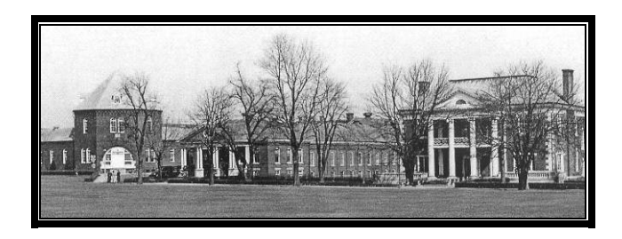
Parade Ground with Receiving Barracks, Post Exchange and YMCA/USO/Service Club in background

Over its nearly 100 year history the installation at Davids Island, formally named Fort Slocum in 1896, has been home