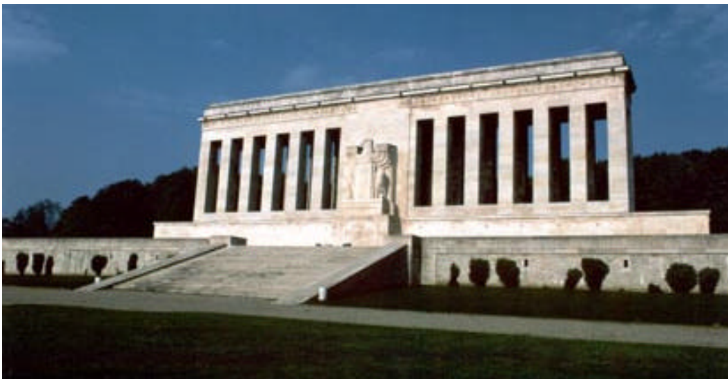
East Face of Monument