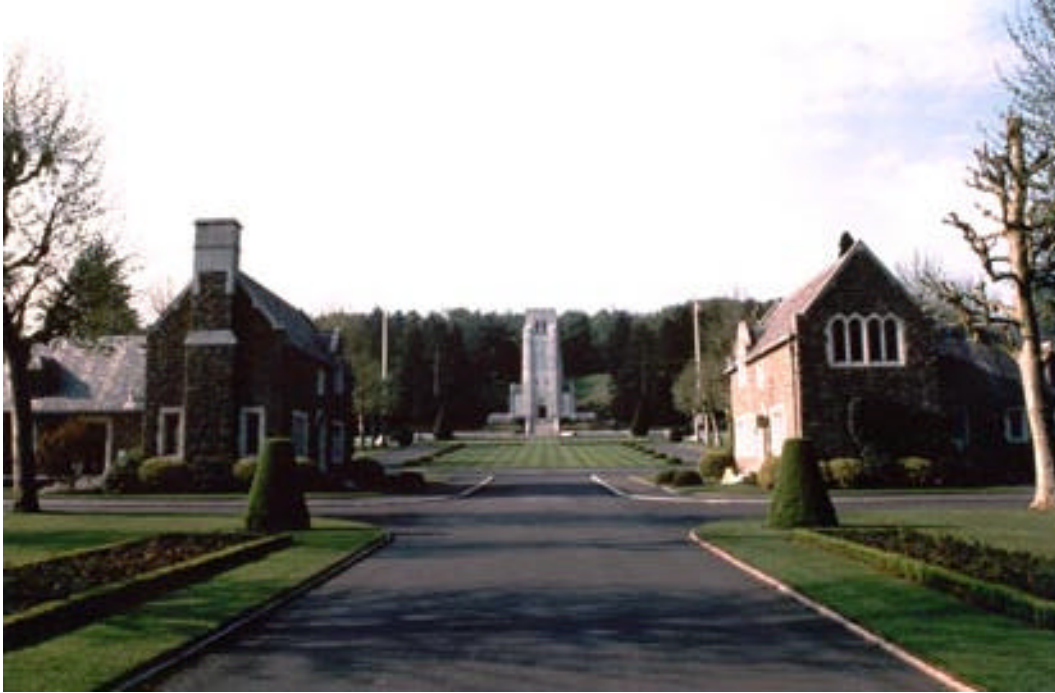
Superintendent's Quarters and Visitors Building (Chapel in rear)