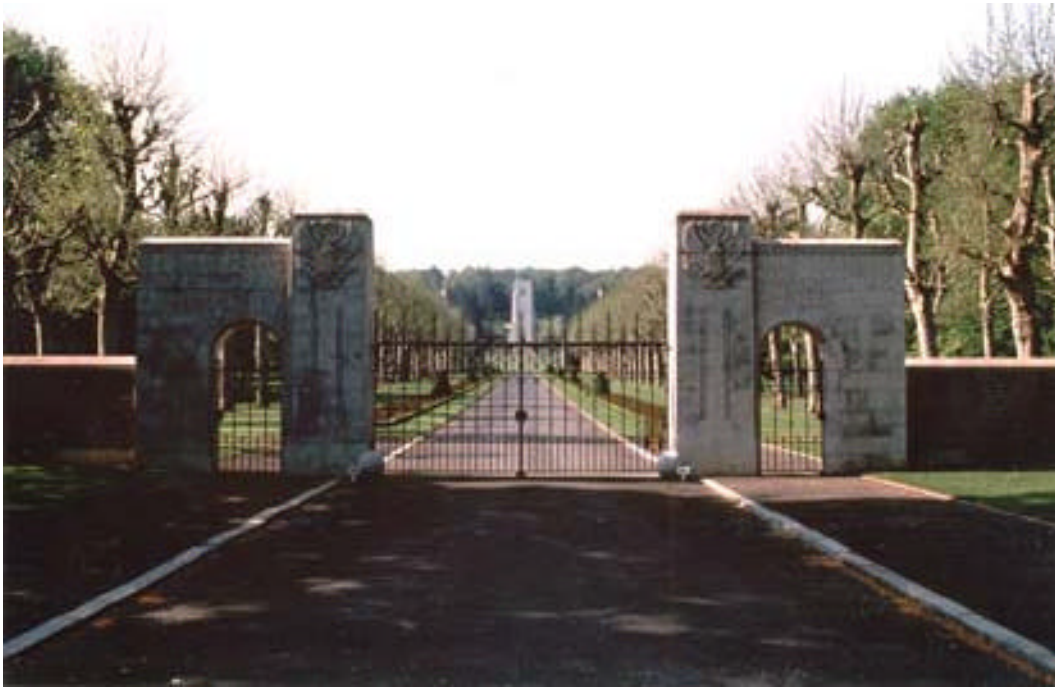
Entrance to the Cemetery