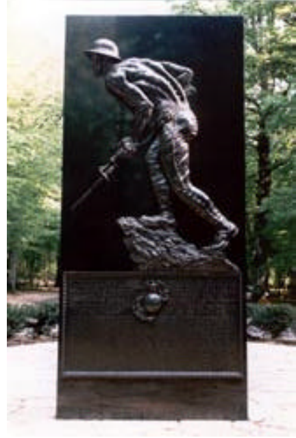
Marine Monument at Belleau Wood

POSTIONS SOUTH AND WEST OF BELLEAU WOOD, THE 4TH MARINE BRIGADE, COMPOSED OF THE 5TH AND 6TH MARINE REGIMENTS AND THE 6TH MACHINE GUN BATTALION, STOOD FIRM UNDER UNREMITTING ENEMY ATTACKS FROM 1 TO 5 JUNE. ON 6 JUNE, THE MARINES BEGAN A SERIES OF ATTACKS WHICH CULMINATED ON 25 JUNE WITH THE CAPTURE OF THE ENTIRE BELLEAU WOOD AREA, AND THE DEFEAT OF THE GERMAN OFFENSIVE IN THIS SECTOR. MAY THE GALLANT MARINES WHO GAVE THEIR LIVES FOR CORPS AND COUNTRY REST IN PEACE.