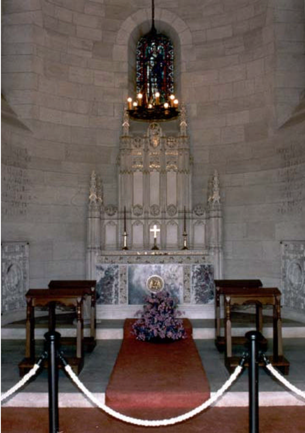
Apse in Chapel