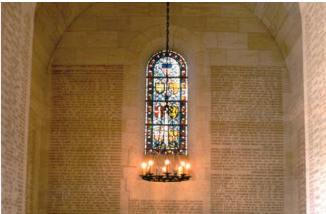
Chapel Interior with Names of Missing on Side Walls

The Chapel is entered through a large double door of oak, ornamented with wrought iron, which opens onto the vestibule. Above the inside of the entrance is inscribed: