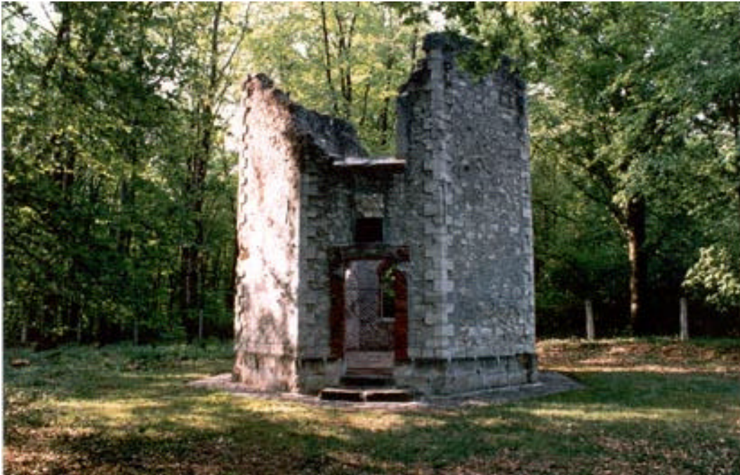
World War I Ruins at Belleau Wood