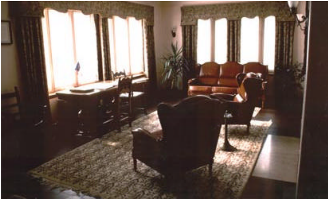
Interior of Visitors Building