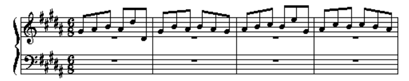
Subject: Fugue No. 18, Well-Tempered Clavier, Book II

To read this essay in its hypermedia format, go to the Shockwave movie at http://jan.ucc.nau.edu/~tas3/wtc/ii18.html.