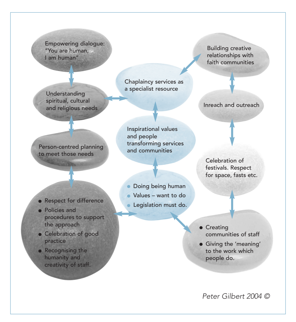
Diagram 2: Inspiring People – Inspiring Services