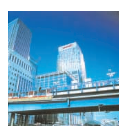
figure 4D.2 Docklands Light Railway and possible extensions