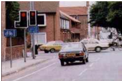
Barmby Gate, Newark

This leaflet summarises the findings of studies to monitor trial installations of Advanced Stop Lines for cyclists (ASLs); provides basic design details for two different layouts; and suggests possible further developments.