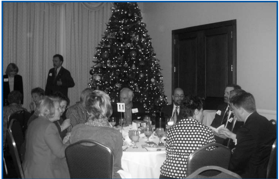
220 guests attended Arizona's 1st Annual Mercy in the Morning Breakfast at the Phoenix Country Club on December 5, 2007.

We apologize in advance for any errors or omissions on this list.