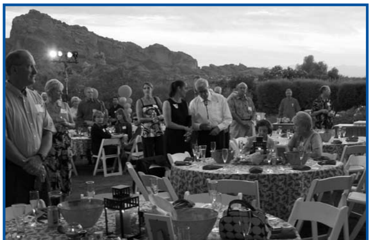
Guests enjoy a beautiful sunset at the French home.