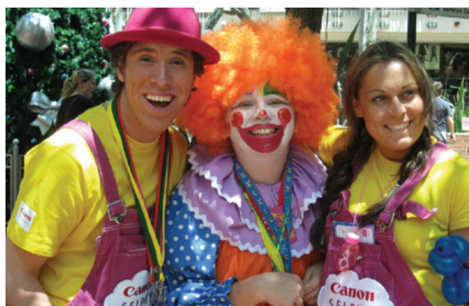
SELPHY Giggle Squad

On December 17, 2008, a group of thirteen Canon Australia employees volunteered to spruce up Barnardo's Kingston House in Sydney, NSW – a charity-based accommodation facility for young people. Armed with brushes, tins of paint and a passionate attitude, the crew spent many hours revitalising the exterior of the old brick building – just in time for Christmas.