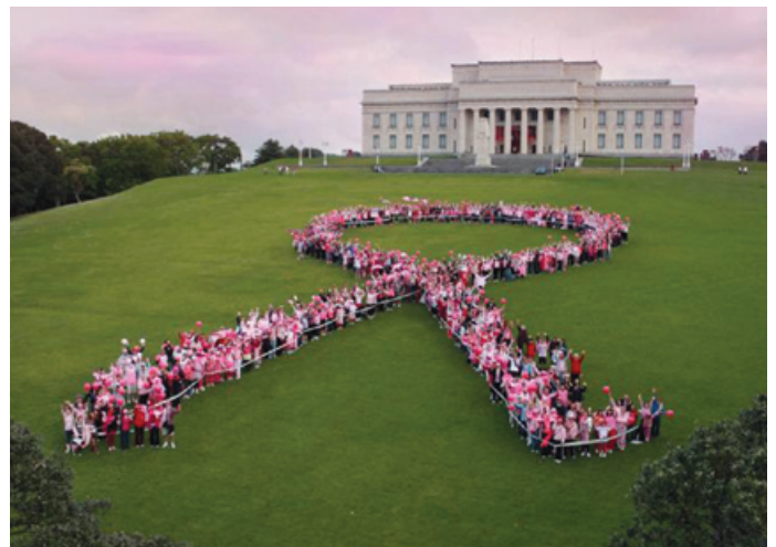
Canon New Zealand's Big Pink Pic