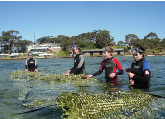
Albany Senior High School (WA)