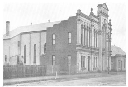
Armidale Town Hall c. 1910