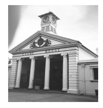
Armidale Court House 1996