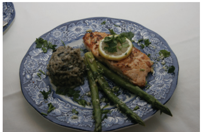
Pine Nut Crusted Salmon with Risotto - Team Dante

At the end of two and a half hours of furious cooking, Duc and I had made seven phenomenal plates. Dante and Andres had made four dishes, which looked wonderful in their own right. They went first, offering the judges a pine nut and butternut squash soup with prosciutto bruscetta; gnocchi with pine nuts in cream sauce; pine nut crusted salmon with asparagus and risotto; and for dessert, a pine nut cheese-cake tart. I thought their dishes looked beautiful and promising, but the only true taste sensa-