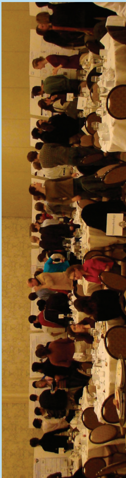
The poster session for BBS applicants, February 2009.

My most memorable interview moment actually happened right here at Yale. The student who picked me up from the airport was telling me a bit about Yale and New Haven during the drive back to campus. Eventually, our car pulled up to a stoplight next to one of the university's infamous secret societies, and my host started telling me about them, stressing that part of