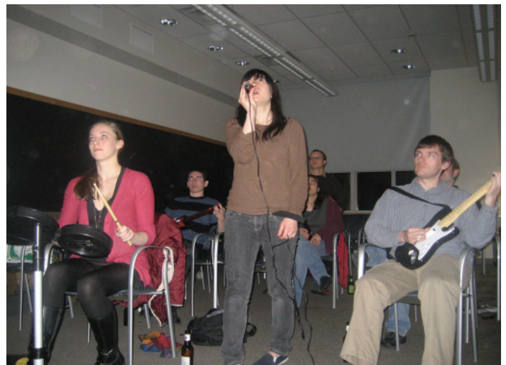
Neuroscience Visiting Day entertainment.