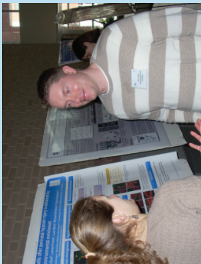
Neuroscience Poster Session.

After picking my host up off the ground I told him that I thought I should find someone else to show me around, and he agreed to send another student to meet me after the interview. A few weeks later, I received a call saying that I was accepted into the program. Before he hung up, the professor told me that he was sorry I got stuck with such a "jerk" for a host. I was startled, because I hadn't said anything about my host to the school administrators. Apparently the story had gotten around. B