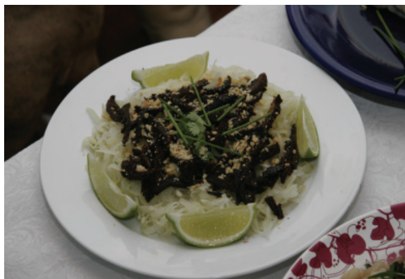
Green Papaya, Chinese Dried Beef and Crushed Pine Nut Salad-Team Duc

dipping sauce, a refreshing bite of cilantro and chilled rice noodles. Third we served pine nut butter and “jelly” sandwiches, made with homemade pine nut paste and sweet, savory red beet marmalade on focaccia bread. The PB&J was voted most creative, and convinced more than one skeptic that beets are a delicious and versatile vegetable. Fourth and fifth were a pair of Vietnamese salads—roast eggplant, and shredded green papaya