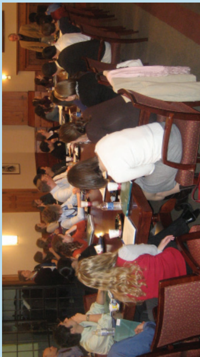
Neuroscience Welcoming Breakfast Visiting Day.