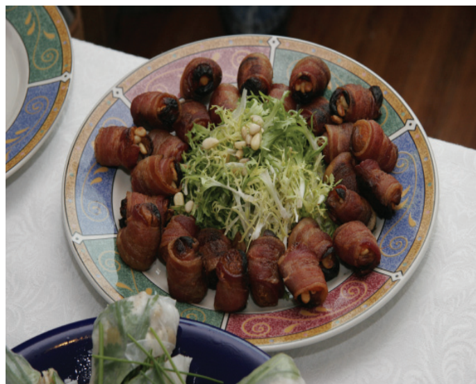
Bacon Wrapped Pine Nut Stuffed Apricots - Team Duc

seven dishes. Thus, the napa cabbage leaves stuffed with ground turkey, pine nuts and coconut, with pine nut tahini sauce, was held back. The first dish we offered was pine nut-stuffed, bacon-wrapped apricots. These sweet, salty nuggets, piled high around a bed of frisee lettuce, were a big hit. Next came fresh chicken shiitake spring rolls with pine nut