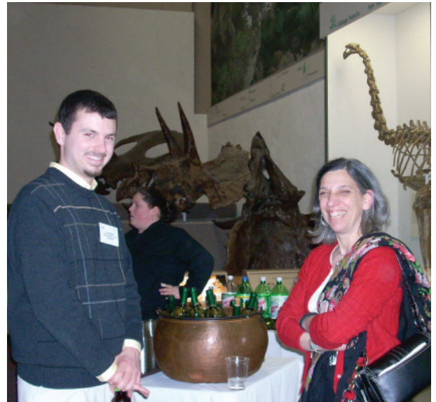
Neuroscience Reception at the Hall of Dinosaurs, Peabody Museum.