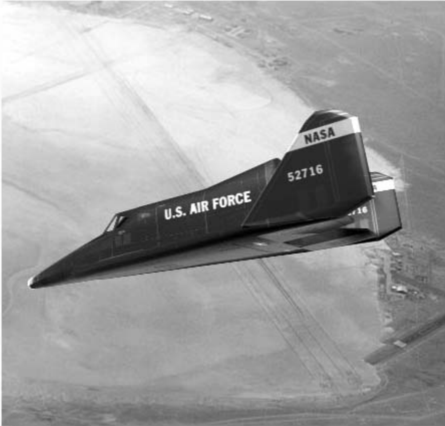
Conceptual renderings of Dynasoar