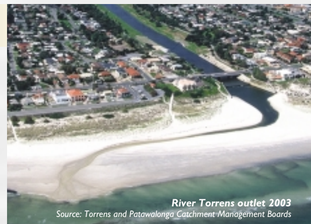
River Torrens outlet 2003

The literature review indicates that toxicants are unlikely to be a significant factor in large-scale declines of seagrass along the metro coast, given the doses required to affect seagrass health.