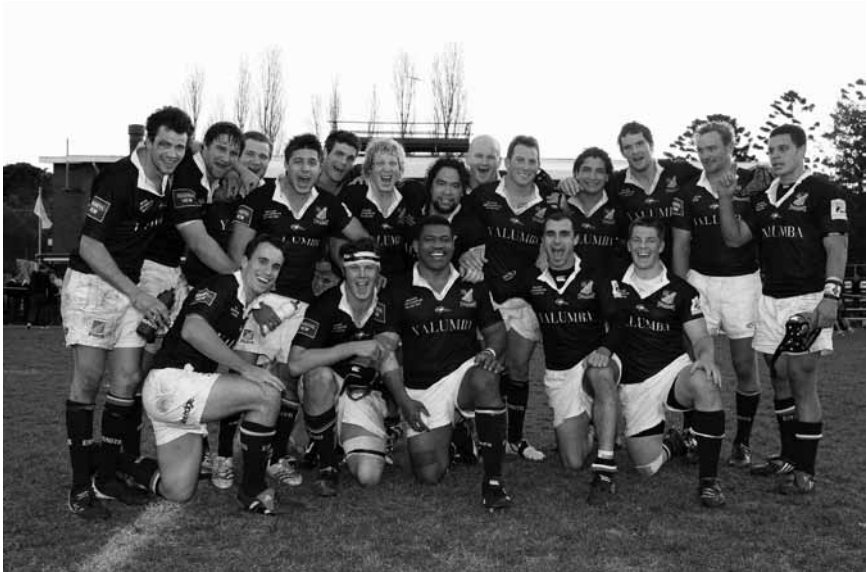
1st Grade celebrate after defeating Sydney University 27 – 18 in the 200th game between the two clubs on July 19th 2008.

Nomination Forms are available from the Club.