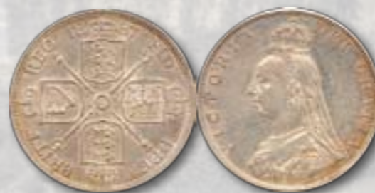
1887 Victoria Jubilee Roman I in Date Double Florin Grade: about Extremely Fine/ good Extremely Fine Price: $100