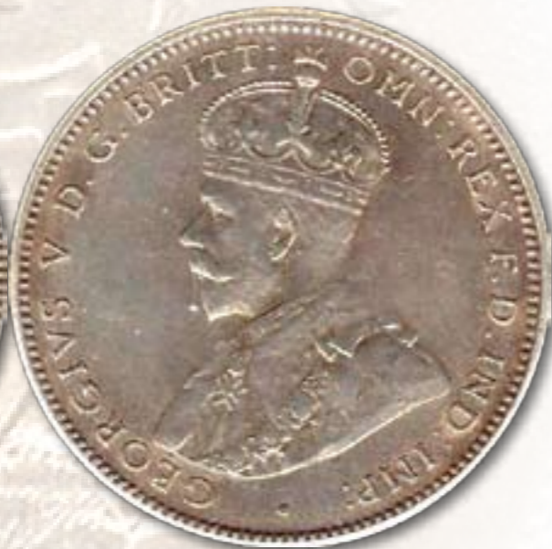
1935 George V Shilling Grade: Specimen Price: $9,000