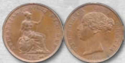
1854 Victoria Halfpenny Grade: Uncirculated Price: $250