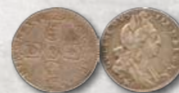
1697 William III Norwich Mint Sixpence Grade: Very Fine Price: $240