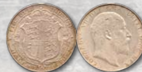
1903 Edward VII Half Crown Grade: Extremely Fine with obverse knocks Price: $1,800

Due to popularity we urge you to order promptly as these are single items only