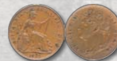
1825 George IV Farthing Grade: about Extremely Fine Price: $100