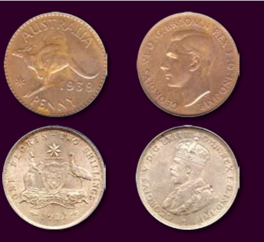
1938 Proof Penny Grade: FDC Price: $38,000

Always a favourite - always a winner no matter what your reason for buying!