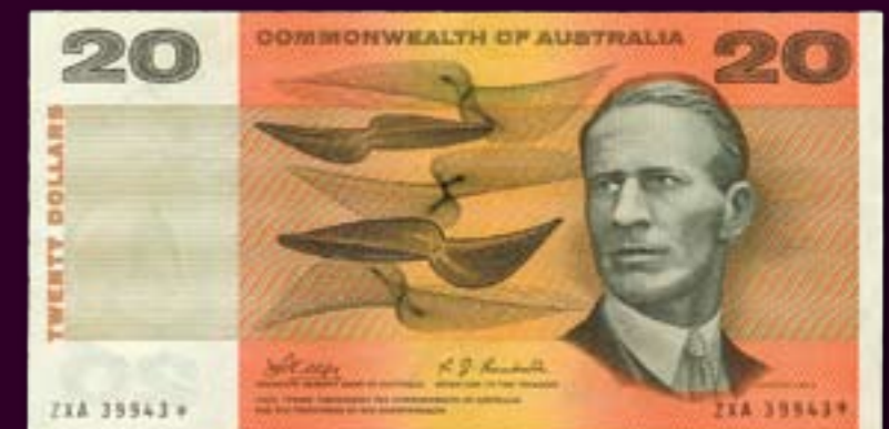
1968 Twenty Dollar Star Note Signed: Phillips Randall Cat #: R403s Grade: good Extremely Fine Price: $19,000