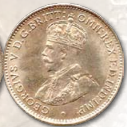
1911 George V Threepence Grade: Gem Uncirculated Price: $2,100