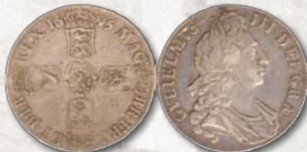
1695 William III Crown Grade: good Very Fine Price: $1,250