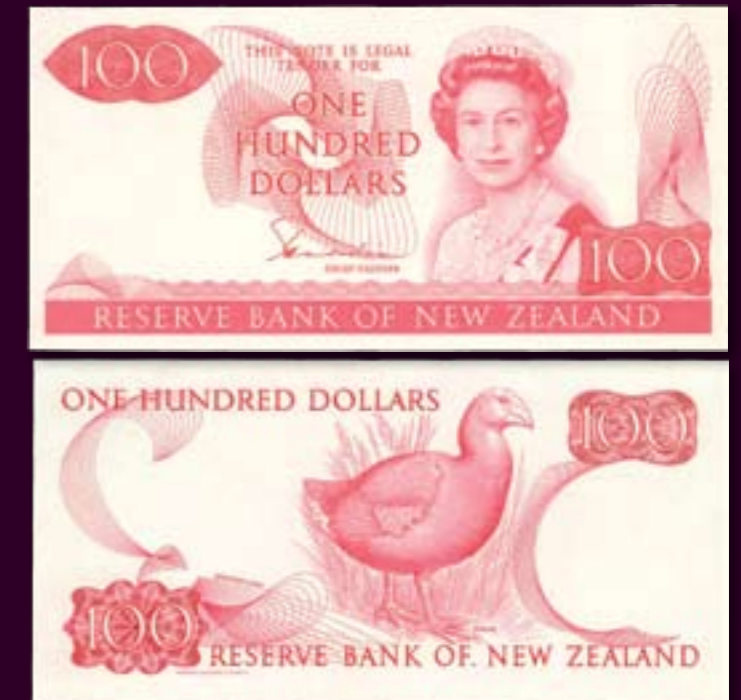
1981 New Zealand One Hundred Dollar Colour Trial Obverse and Reverse Cat #: R175a Grade: Uncirculated Price: $6,500 the pair

Closely linked with Australia's history, New Zealand's banknotes now rank a close second to the popularity of Australia's banknotes and equally as potential!