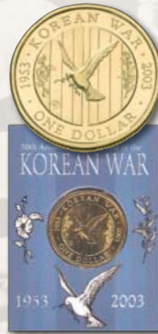
2003 Korean War $1 Uncirculated m/mark B/S/M/C $6.00ea