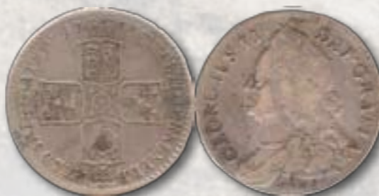
1745 George II Lima Below Bust Half Crown Grade: about Very Fine Price: $275