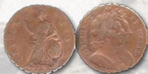
1694 William & Mary Halfpenny Pattern Deckled Edge Grade: good Fine Price: $350