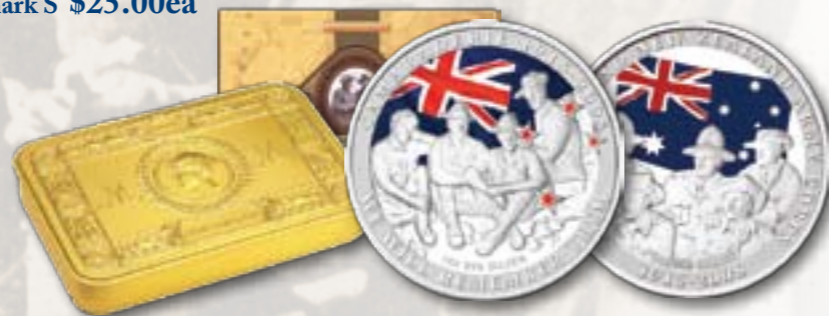
2005 ANZAC 90th Anniversary silver/colour $1 proof pair, cased $165.00ea