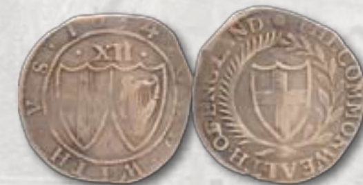
1654 Commonwealth Shilling Grade: Very Fine Price: $950