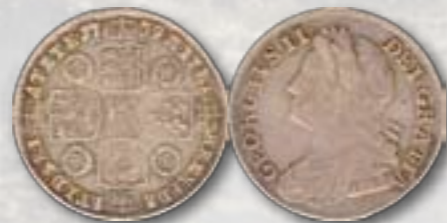
1739 George II Small Garter Star Variety Shilling Grade: Very Fine + Price: $600