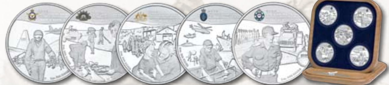
2005 Australian Peacekeepers $5 Silver Proof Coin Set of 5 - $500.00 Superb Jarrah Display Case