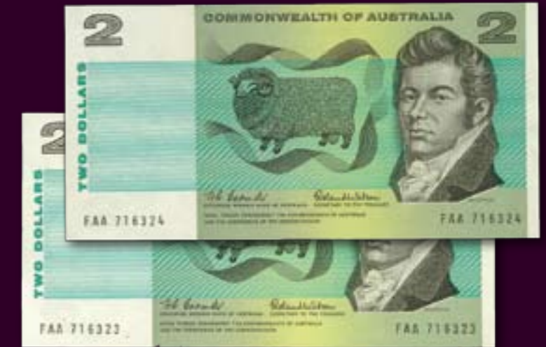
1966 Two Dollar Consecutive Pair First Prefix Signed: Coombs Wilson Cat #: R81FP Grade: Uncirculated Price: $9,500 the pair

The reality of the true limited availability of scarce decimal paper banknotes has seen some remarkable price growth in the past five years. Market research now indicates a strong trend towards this area of the banknote market since its withdrawal from circulation in the early 1990's, so buyers will continue to reap pleasing future returns.