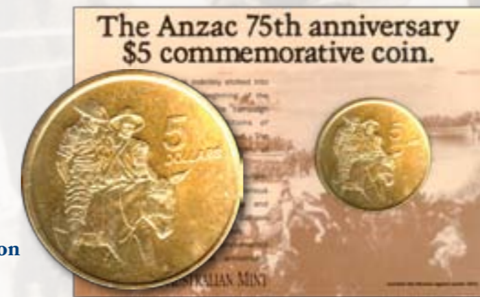
1990 75th Anniversary of ANZAC $5 Uncirculated Coin $12.00ea