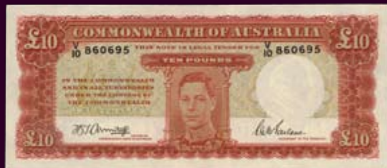
1943 George VI Ten Pound Note Signed: Armitage McFarlane Cat #: R59 Grade: about Uncirculated/Uncirculated Price: $7,500