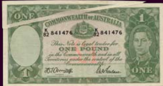
1942 George VI One Pound Error Note Signed: Armitage McFarlane Cat #: R30b Grade: Very Fine Price: $4,500

Classic error showing fold in paper at time of printing. Pre Decimal error notes are very scarce and in demand!