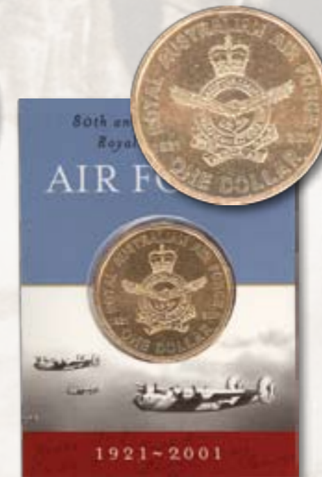
2001 80th Anniversary of RAAF $1 Uncirculated $24.00ea