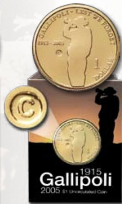
2005 Gallipoli Commemoration $1 Uncirculated m/mark C/M/B/S $5.00ea scarce m/mark G $49.90ea