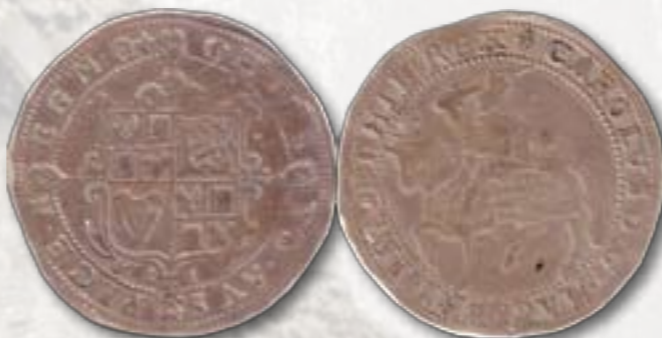
1625 Charles I Tower Mint Type 1a Five Shilling Grade: about Very Fine Price: $2,500