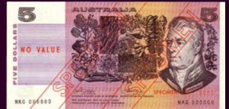
1974 Five Dollar Specimen Note Scarce Type 3 Signed: Phillips Wheeler Cat #: RDS18 Grade: about Uncirculated/Uncirculated Price: $36,000