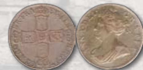
1702 Queen Anne First Bust. No Plumes Shilling Grade: Extremely Fine Price: $1,650