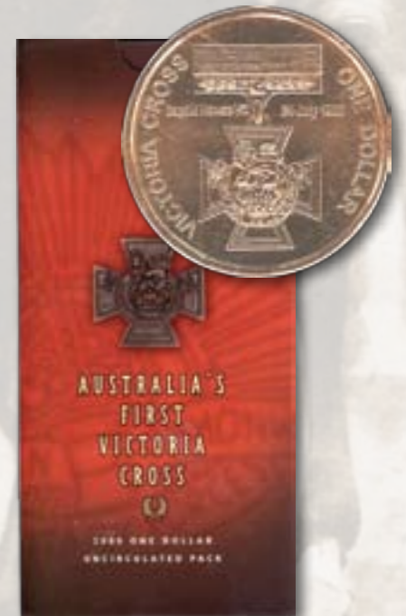
2000 Australia's 1st Victoria Cross $1 Uncirculated very scarce, only 3 available $250.00ea