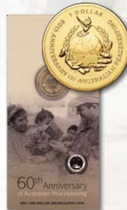
2007 60th Anniversary of Australian Peacekeeping $1 Uncirculated $12.95ea