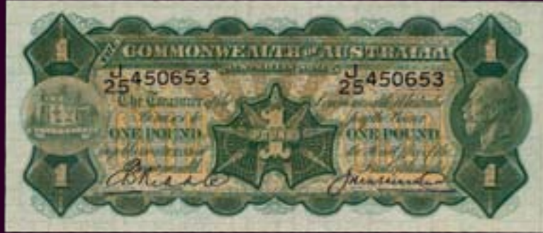
1927 George V One Pound Note Signed: Riddle Heathershaw Cat #: R26 Grade: Uncirculated Price: $8,750

Undoubtedly the most sought after Australian banknotes in the current numismatic climate are the Commonwealth series 1913 to 1961. Now in stronger demand than ever as buyers fiercely compete for remaining choice quality pieces at these currently very appealing price levels!