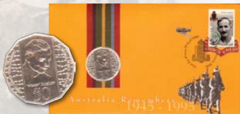
1995 Weary Dunlop 50 cent Stamp & Coin Cover $30.00ea