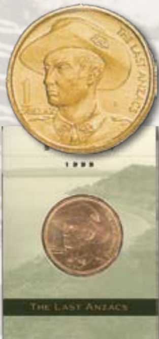
1999 The Last ANZACS $1 Uncirculated m/mark A/B $35.00ea m/mark S/C/M $30.00ea