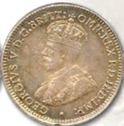
1924 George V Threepence Grade: Gem Uncirculated Price: $5,000