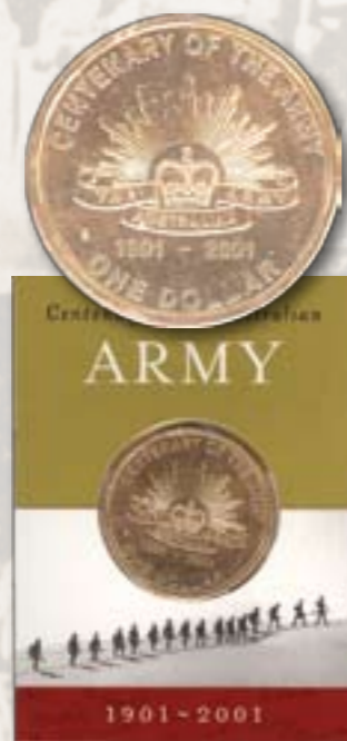
2001 Centenary of the Australian Army $1 Uncirculated m/mark C $18.00ea m/mark S $25.00ea