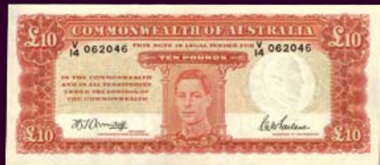
1943 George VI Ten Pound Note Signed: Armitage McFarlane Cat #: R59 Grade: Uncirculated Price: $10,000