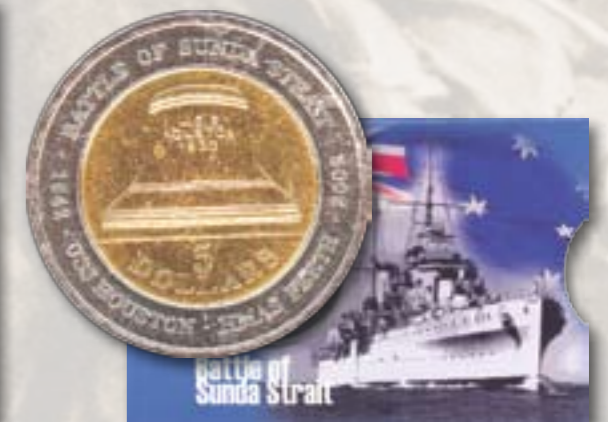
2002 HMAS Perth Battle of Sunda Strait Commemorative $5 Uncirculated Coin $15.00ea