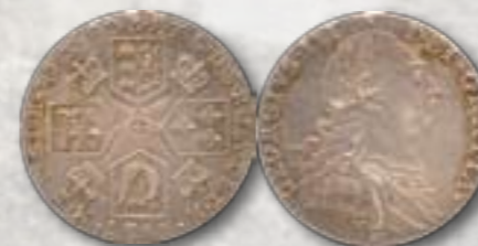
1787 George III No Hearts Shilling Grade: good Extremely Fine Price: $250