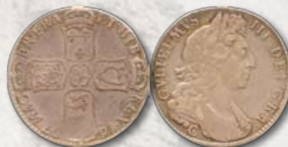
1697 William III Chester Mint Half Crown Grade: about Very Fine Price: $685