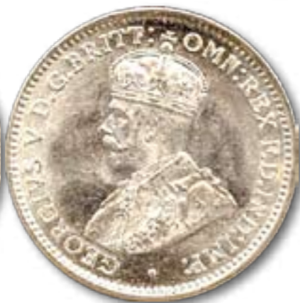
1921 George V Threepence Grade: Choice Uncirculated Price: $3,500