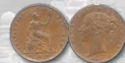
1840 Victoria Farthing Grade: Extremely Fine Price: $100