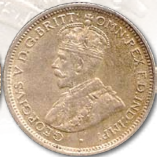
1922 George V Sixpence Grade: Choice Uncirculated Price: $5,250