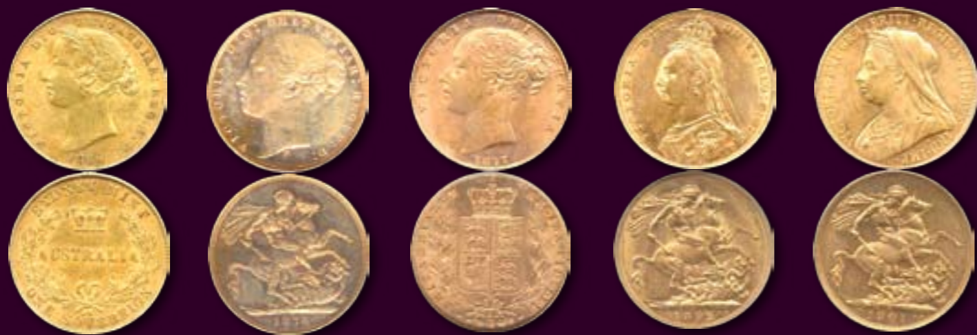
1866-1901 Sovereigns - Queen Victoria Type Set of Five Coins Grade: Uncirculated - Choice Uncirculated Price: $12,500 - 5 coin set (in timber box)

The implementation of Queen Victoria's Order in Council of 1853 to establish a branch of the Royal Australian Mint in Sydney occurred in 1855, and the Mint also started to produce Australia's first sovereigns the same year. This highly collectable type set features each of the five head 'type' sovereign variations that were produced during Queen Victoria's reign. They're often referred to as the 'Young', 'Jubilee' and 'Veiled' head types.