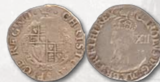
1635 - 36 Charles I Tower Mint Shilling Grade: Very Fine Price: $400