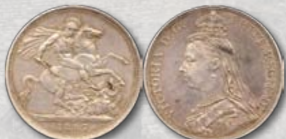
1887 Victoria Jubilee Silver Crown Grade: Extremely Fine Price: $150