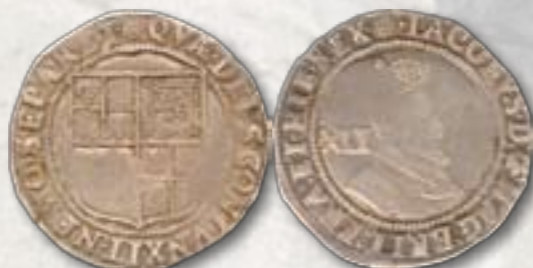
1605 - 06 James I Fourth Bust Shilling Grade: Very Fine Price: $600