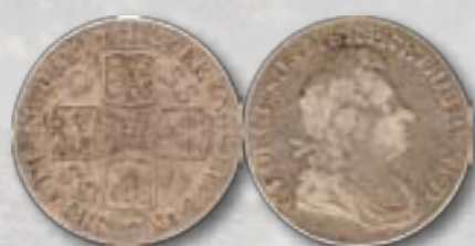
1723 George I SSC in Angles First Bust Shilling Grade: about Very Fine Price: $200