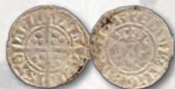
1279 - 1307 Edward I Silver Penny Bristol Mint Grade: about Very Fine Price: $120

Some of the most historically significant coin collections ever assembled in the world today have been inspired by the fascinating coinage of Great Britain. From the crude hammered coinage of the Anglo-Saxon and Norman Mints c.650-973 through to the intricately crafted coinage of the 18th century Victorian era, coins of Great Britain have romanticised collectors throughout countless generations and are as ever popular to this day. Very few opportunities arise to offer a fine selection of historically significant pieces from early Great Britain. As such, the fascinating coins featured here represent prized acquisitions for the discerning collector or investor of early period British coins.