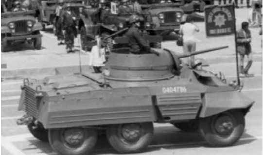
M8 Greyhound during parade in Mexico City. (Photo: Author's collection).

Remarks : Post-WWII, Mexico received 38 Greyhounds from the US as part of the Military Aid Program. As of 1990 15 of these cars were still in service (see US for vehicle details).