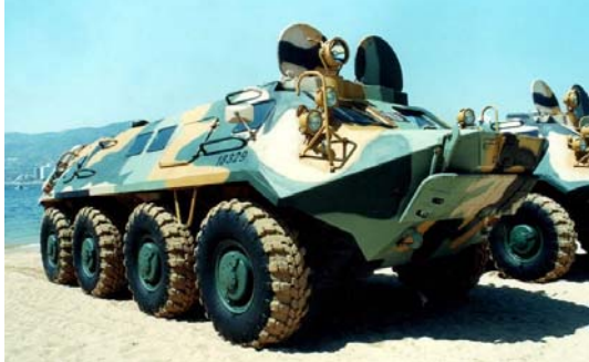
Above: Mexican Navy Marine APC-70. This vehicle is a modified Russian BTR-60 PB.