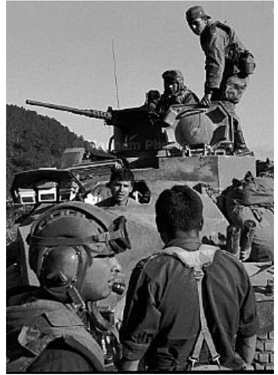
Remarks : Mexican Army VCR-TT (see France for vehicle details).