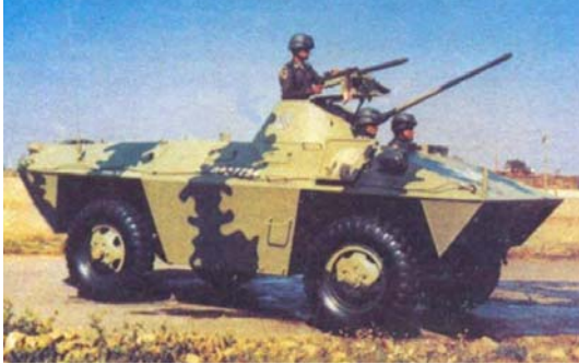
Above: US produced 4x4 armored car with 20mm cannon.