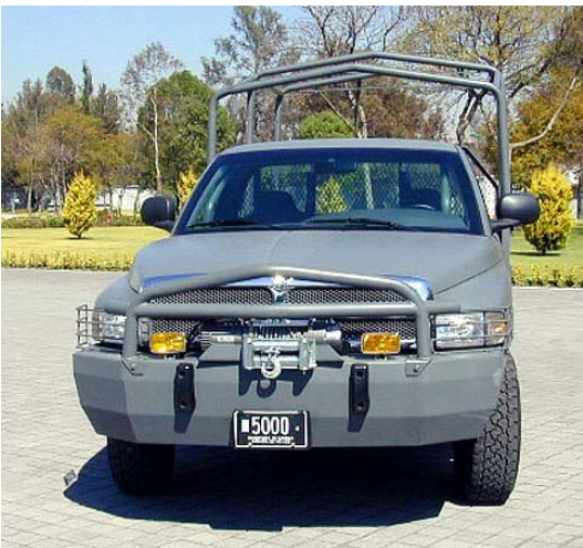
Above: Mexican Navy (1996) Dodge APC used by rapid reaction forces.

2006 Carr, Pers, Armd, 4x4. Dodge Mini-Commando.