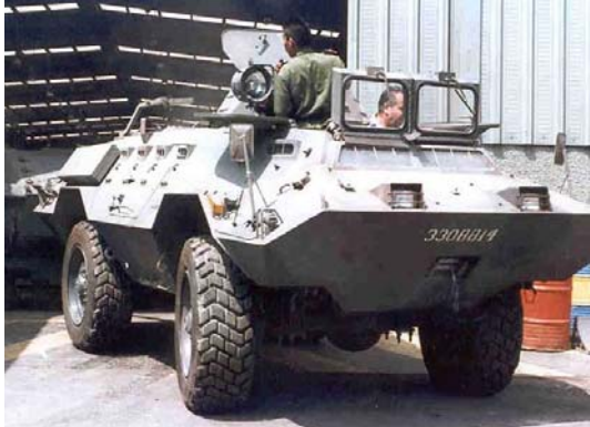
Remarks: Locally produced armored car series.

1994 Car, Armd, 4x4. Fox . In 1994 a single Fox armored car was transferred to Mexico from the UK (see UK for vehicle details).