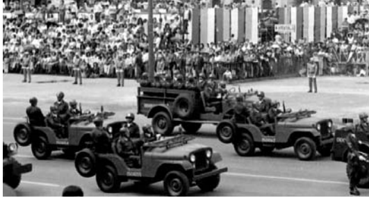
Above: CJ-5 "Jeeps" of the Mexican Army during a parade in 1974.

Remarks : Built by Vehiculos Automotores Mexicanos (VAM) (see US for vehicle details).