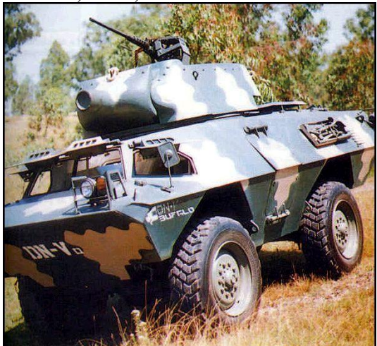
Above: Mexican DN-V with turret and 75mm howitzer from excess M8 Howitzer Motor Carriages.