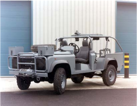
Above: Mexican Navy Land Rover Defender used by rapid reaction forces.