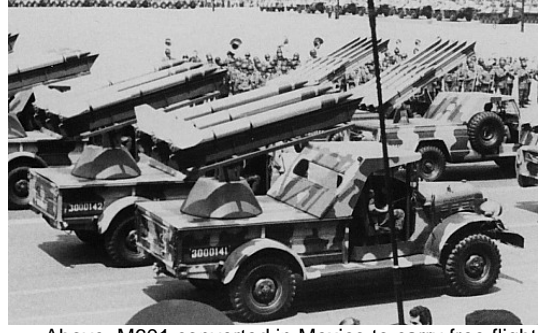
Above: M601 converted in Mexico to carry free flight rockets.

1970 Carr, Wpns, Trk, 1-T, 4x4, Launcher Rkt, M601