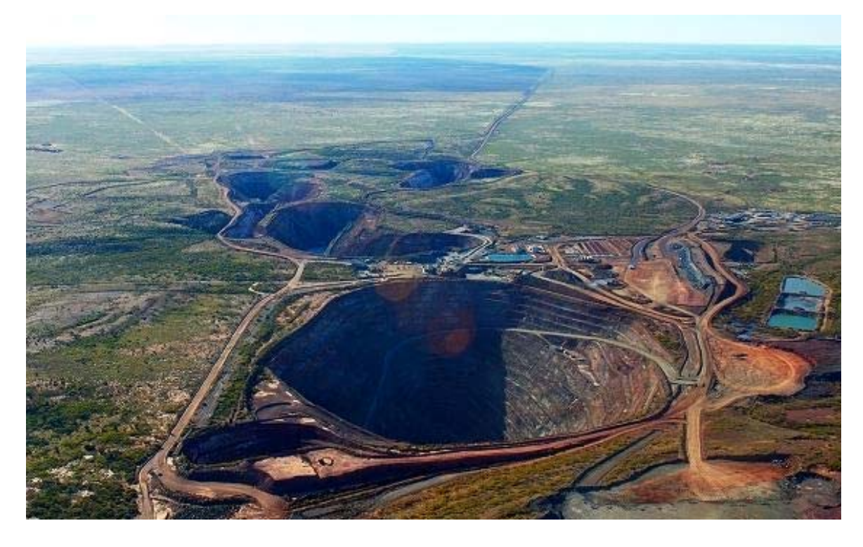
PICTURED ABOVE: Aerial view of Granites Gold Mine

Newmont maintain strong partnerships with key NGOs operating in the Tanami region, including the Mt Theo organisation, Warlukurlangu Artists Aboriginal Corporation, the Warlpiri Education and Training Trust. Newmont is a major supporter of the Milpirri Festival in partnership with the Rio Tinto Aboriginal Foundation. Recognising the numerous benefits that swimming pools have created in various remote Aboriginal communities around Australia, Newmont is pledging $150,000 over 3 years towards the operation of the new community swimming pool at Yuendumu.