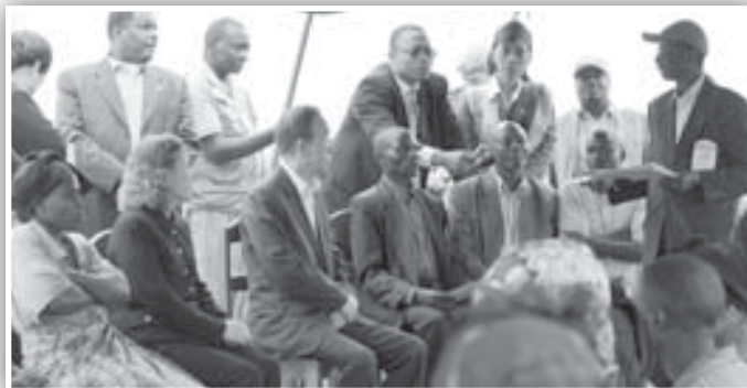
United Nations Secretary-General Ban Ki-moon meets leaders of the Kitabati camp for Internally Displaced Persons.

Almost five and a half million people have died due to conflict in the Democratic Republic of Congo (DRC) since 1998. Millions more have been displaced. The conflict has had a particularly disastrous impact on women and girls, some 500,000 of whom have suffered sexual violence. Children have been and are used as soldiers. Demand for minerals found in the eastern DRC and used in everyday electronics products helps finance the armed groups engaged in this violent struggle. The minerals are cassiterite (tin ore), gold, coltan (tantalum)