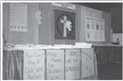
An early display by the Presbyterian Peacemaking Program.

Plan now to observe the thirtieth anniversary of Peacemaking: The Believers' Calling in 2010. Adopted by the 192nd General Assembly (1980), this report led to a renewed peacemaking emphasis across the church and to the creation of the Peacemaking Offering and the Presbyterian Peacemaking Program. Peacemaking: The Believers' Calling was written in response to a 1975 call for a study on peacemaking. This time period saw the end of American involvement in the war in Southeast Asia, changing international power dynamics, a nuclear arms race and growing concern for the oppressed. The space program provided images of a beautiful blue marble suspended in space—a reminder of the interrelatedness of life. Moved by a 1978 visit to South Korea, United Presbyterian Women declared peacemaking a mandate for their next triennium. In this context of