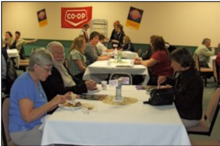
Co-op members enjoying a roast beef supper prepared by our own Food Store employees