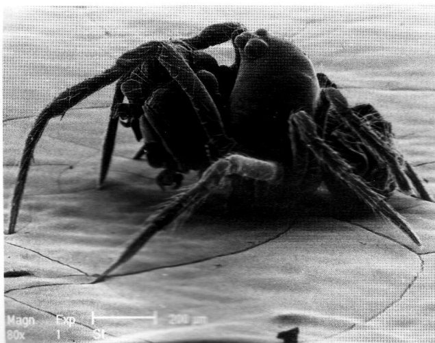
Fig. 2. Mysmenella jobi . SEM photograph of male.

Specimens (b) and (c) were collected during a long-term investigation of the spider fauna in Poleski National Park, carried out from 1995–1998. Ten pitfall traps were placed in a line and were emptied fortnightly from March/April to November. Mysmenella jobi was not recorded in other studied habitats, including: Sphagnum –pine woodland, alder swamp forest, birch–willow scrub, fen and meadows (Kupryjanowicz et al. , 1998; Hajdamowicz, unpubl. data).