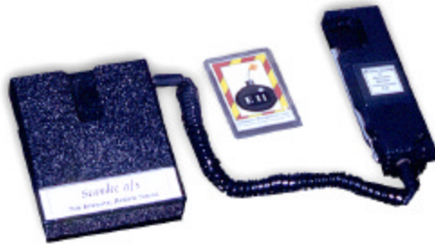
Figure 1. MOLE Programmable Cardholder, Card for Explosives, and Search Handle

To program the product for detecting one or more substances, the operator inserts the appropriate programming cards into a cardholder that is clipped to the operator's belt. The programming holder is attached to the search handle by a short cable with standard phono-jacks on each end. The search handle is a small black plastic handle with a radio-type antenna mounted in a free turning pivot. See Figure 1. When the antenna is fully extended, it can be balanced to protrude in front of the operator but is free to swing to either side with the slightest tilt of the operator's hand.