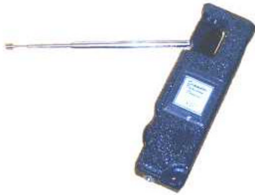
Figure 3. MOLE handle showing permanently attached “Programming Chip”

under the label. Additional information on the Quadro Tracker can be located by performing a search on the World Wide Web using the key words Quadro and Tracker.