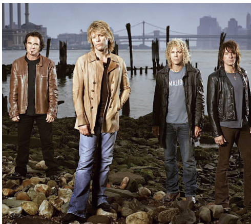
Bon Jovi's 'Circle' rolls to No. 1 on Top Albums.

Ke$ha's "Tik Tok" (Sony Music) holds at No. 1 on the Hot 100 for a second week, nabbing Greatest Gainer/Airplay honours. The track bounds 14-8 on Hot 100 Airplay (10.6 million in audience, up 26%), 7-4 on CHR/Top 40 (7-4) and 46-39 on Hot AC.