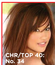
CHR/TOP 40: No. 34