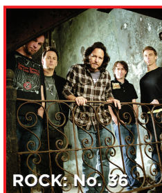
ROCK: No. 36