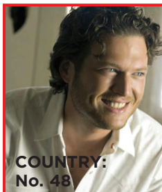
COUNTRY: No. 48