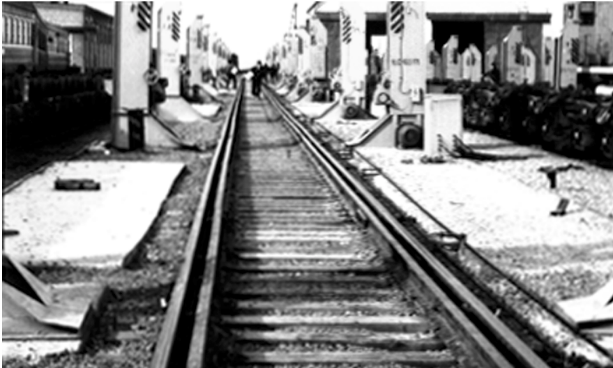
A bogie-changing track at Druzhba Station