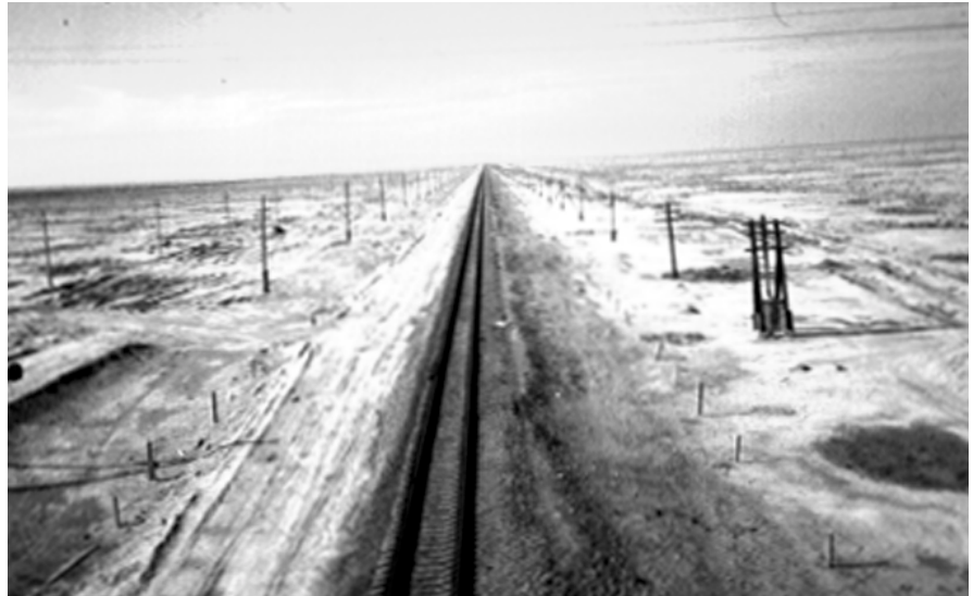
The track extending to the east of Ashkhabad, Turkmenistan, across desert toward the Caspian Sea

Freight carried on the Silk Railway from China is generally bound for Central Asia. From there, freight can be sent by rail via Russia to western Europe. This is relevant when considering Europe-bound freight from Japan. The route from Japan to Rotterdam via Central Asia is about 1000 km shorter than the route via Vladivostok and the Trans-Siberian Railway. But the longer Trans-Siberian route involves only one time-consuming transshipment or bogie change to cope with different track gauges (for example, at the border with Poland or Slovakia), while the shorter Central Asian route involves two. Furthermore, freight transported over the