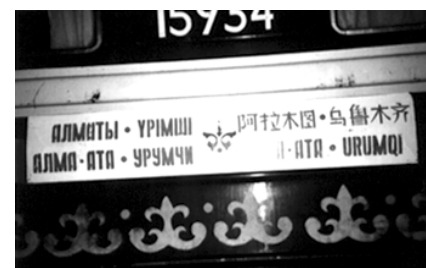
The origin and destination of the Silk Road express are shown in four languages: Kazakh (top left), Russian (bottom left), Chinese (top right) and English.