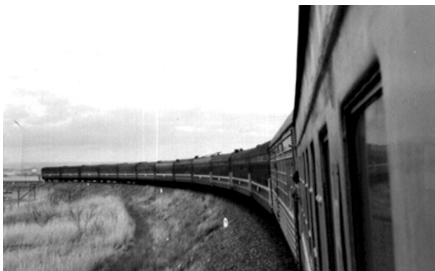
The Silk Road express runs in Eastern Kazakhstan linking Almaty and Ürümqi.

China's east-west main lines are the Longhai Line from Xi'an to Lanzhou, the Lanxin Line from Lanzhou to Ürümqi, and the Beiji Line from Ürümqi to Alashankou. This creates an uninterrupted rail link from east to west