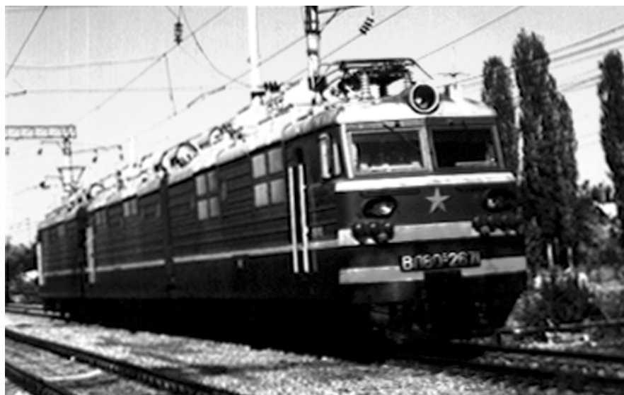
Soviet-built Class VL80 electric locomotive in Uzbekistan

Diesel locomotive horsepower ranges from 3000 to 4000 hp, with some test