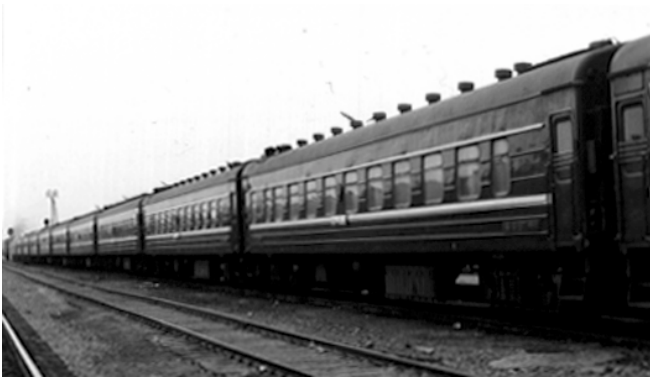
Silk Road express at Druzhba Station