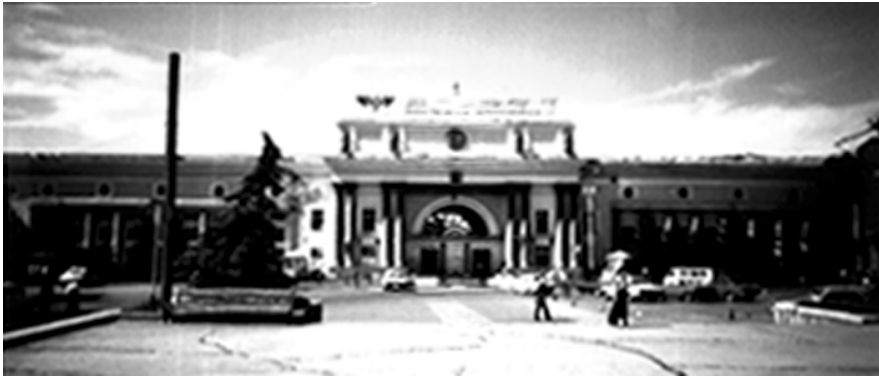
Almaty Station, Kazakhstan