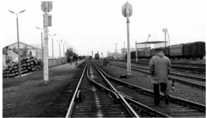
Platform at Druzhba Station with a four-rail track for trains from both directions. The carriages exchange bogies at adjacent depot while passengers are on board.

China, running more or less parallel to Tianshan Beilu, one ancient route of the Silk Road.