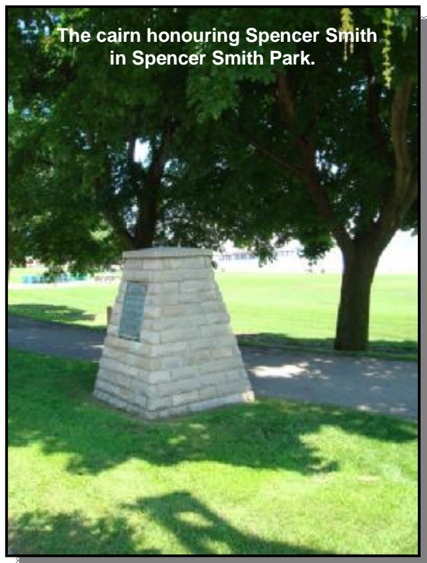
The cairn honouring Spencer Smith in Spencer Smith Park.