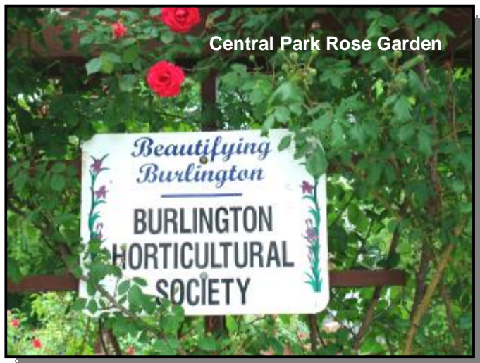
Central Park Rose Garden

Early newspaper articles chronicled the continued success of the group – 111 members by the end of the first year, and the establishment of parks, as well as social outings to attend picnics and view the lilacs, or visit the Rose and Peony Show in Port Credit. Members of the Society acted as the Town's Parks Board for many years, doing much of the physical work involved in establishing local parks, including preparing the soil and doing the planting. Individual members often provided plants and shrubs for various parks.