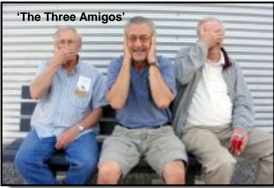
'The Three Amigos'