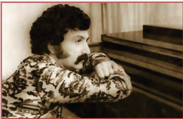
Vagif Mustafazade, founder of Azerbaijani "Jazz Mugham"

Azerbaijan is the only country in Central Eurasia where jazz music has become a significant part of the musical landscape. In the early 1960s, the distinctive style of jazz emerged in Baku, the capital city