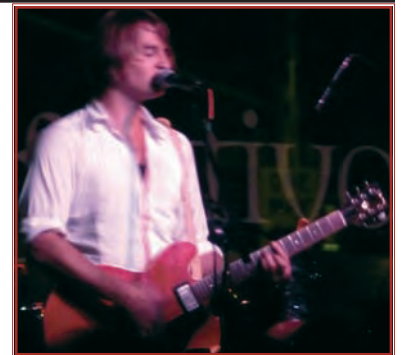
A member of Little Cow performs at Lotus Festival

More information about Lotus and the 2009 performers can be found on the Lotus website: www.lotusfest.org