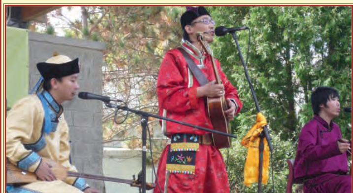
Hanggai performing at Lotus Festival

From Tuvan throat singers to Hungarian ska rockers, Central Eurasia was well represented at the 2009 Lotus Festival. A showcase of world music and art, the Lotus Festival took over downtown Bloomington, Indiana from Thursday, September 24 through Sunday, September 27. Despite a rainy forecast, large