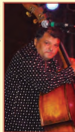
Parno Graszt member

Their blend of musical traditions from Mongolia, including folk instruments and khoomei, or throat singing, with rock instruments and song structures was a fine example of successful world musical fusion.