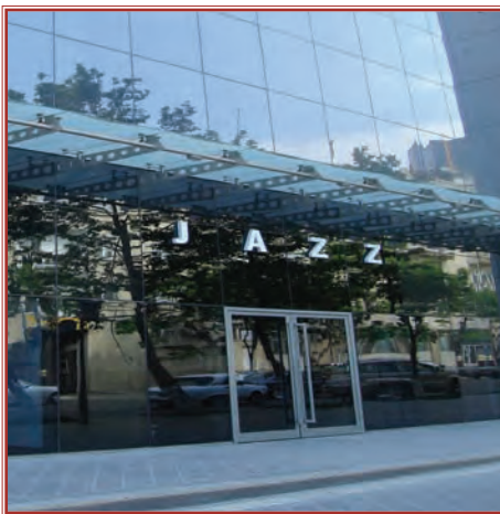
Jazz center at the Baku Music Academy

The situation changed drastically in the 1960s, at the time of the relatively relaxed social and political environment in the Soviet Union known as the "Khrushchev Thaw." People gained access to previously forbidden recordings, musical scores, books, and radio broadcasts. A spirit of experimentalism embraced art and music. Among those bold experimentalists was Vagif Mustafazade (1940-79), a pianist and composer, who first juxtaposed mugham with jazz. His compositions combining soul jazz with the centuries-