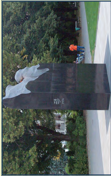
Memorial to the 1956 Revolution, Budapest, Hungary