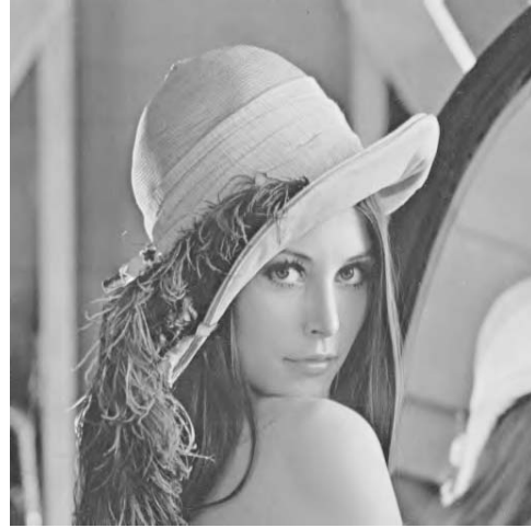
(b) Rate = 0.5 bpp, PSNR = 37.2 dB