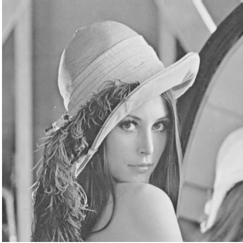
(a) Original LENA