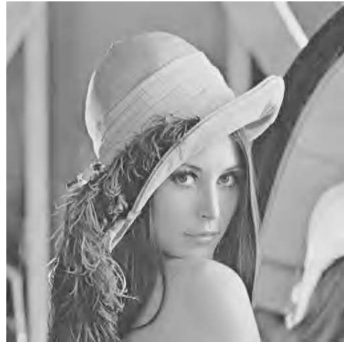
(d) Rate = 0.15 bpp, PSNR = 31.9 dB