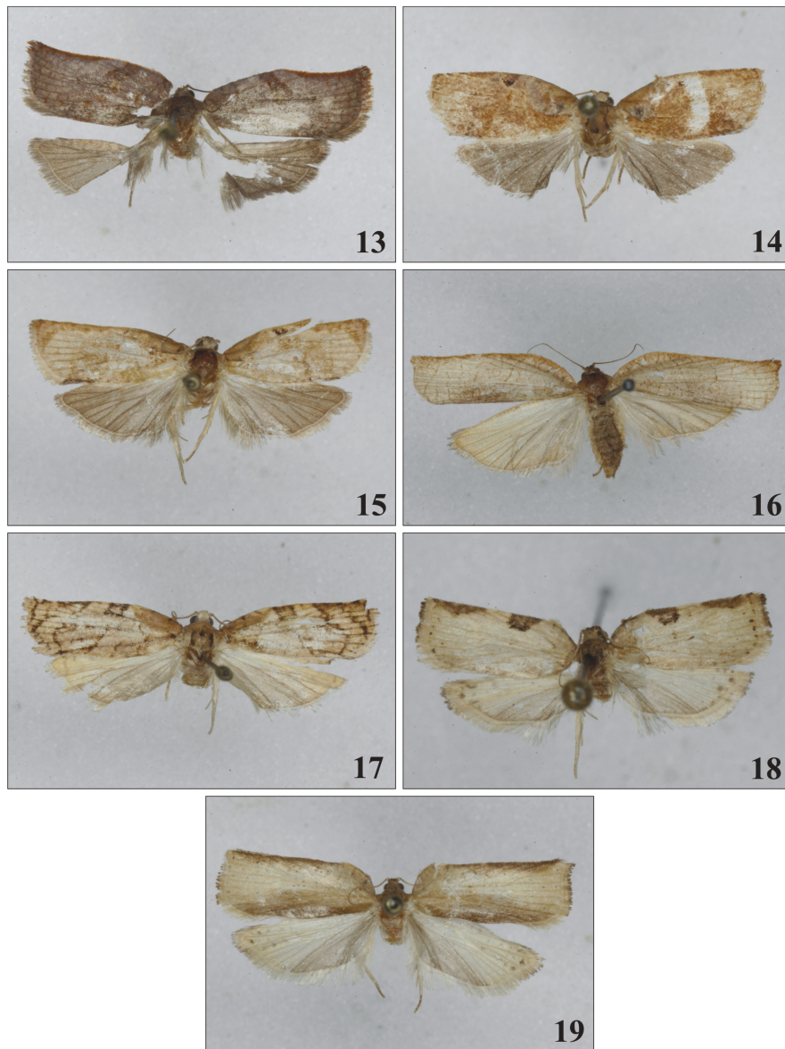
Figs 13-19. Adults: 13 - Choristoneura chapana sp. n., paratype, SA PA; 14 - Homona baolocana sp. n., holotype; 15, 16 - H. parvanima sp. n., paratype; 17 - H. polystriana sp. n., holotype; 18 - Meridemis validana sp. n., paratype, male, SA PA; 19 - M. validana sp. n., holotype, female.