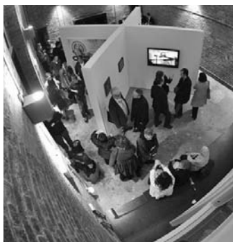
Buildings on Platforms 1 and 2 at Edge Hill station are now used as a public art space

Merseytravel and our partners continue to invest in stations and facilities on the Merseyrail City Line. Here are just a few of the highlights recently undertaken: