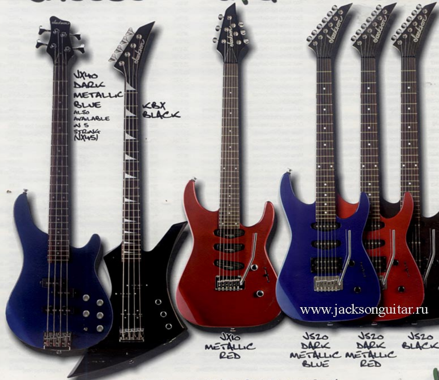
JX40 DARK METALLIC BLUE ALSO AVAILABLE W/ 5 STRINGS (N145)