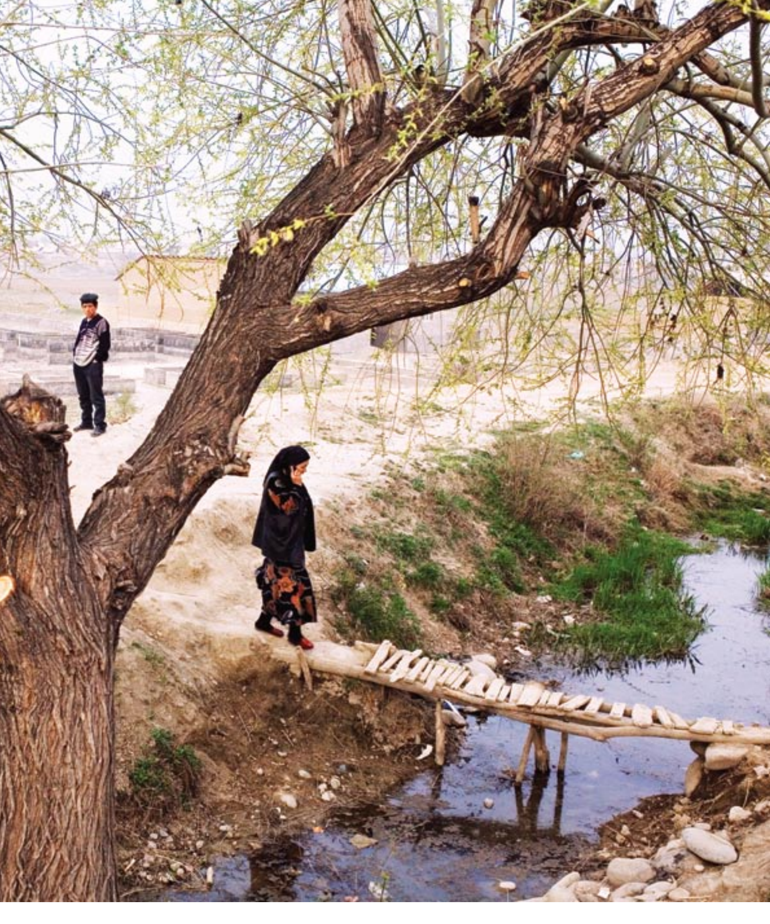
Villagers along a canal near the border between Uzbekistan and Kyrgyzstan | CAROLYN DRAKE