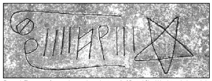
FIGURE 4: The group of seven signs on the perimeter wall of Bayt al-Shaykh's cistern (enhanced via tracing).

On the plaster surface of the Bayt al-Shaykh cistern's perimeter wall, which is partly formed by the immediately adjacent houses, is an inscription together with a group of seven signs (Figure 4, below). Ahmad ibn `Ali al-Buni (d. 1225), a prolific writer on magic, described these signs. The main work attributed to him is Kitab Shams al-Ma`arif wa-Lata`if al-`Awarif . It is assumed, however, that major parts of the book were only written at the beginning of the fourteenth century by a group of authors, for which stylistic reasons can be cited, as well as the fact that the text mentions individuals who lived after al-Buni's death.<sup>5</sup> For the purposes of this article, the question of authorship and exact date are not significant. The work and al-Buni, both of