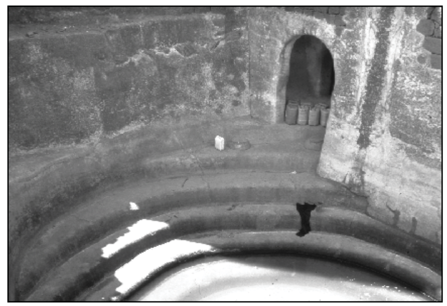
FIGURE 3: The Bayt al-Shaykh settlement's cistern.

On the plaster surface of the Bayt al-Shaykh cistern's perimeter wall, which is partly formed by the immediately adjacent houses, is an inscription together with a group of seven signs (Figure 4, below). Ahmad ibn `Ali al-Buni (d. 1225), a prolific writer on magic, described these signs. The main work attributed to him is Kitab Shams al-Ma`arif wa-Lata`if al-`Awarif . It is assumed, however, that major parts of the book were only written at the beginning of the fourteenth century by a group of authors, for which stylistic reasons can be cited, as well as the fact that the text mentions individuals who lived after al-Buni's death.<sup>5</sup> For the purposes of this article, the question of authorship and exact date are not significant. The work and al-Buni, both of