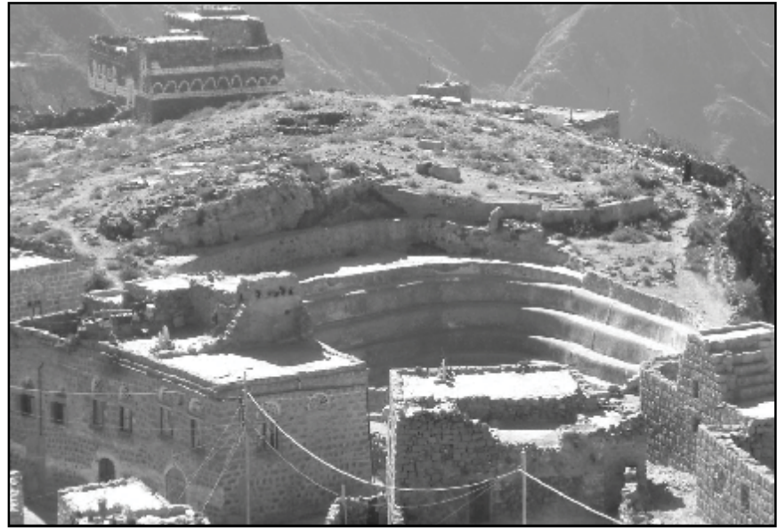
Figure 2: Public cistern on the escarpment of al-Jabin.

north side and one on its south side (Figure 2). The southern one, situated below the military fort, developed a crack years ago and, despite an attempt to mend it, remains largely empty; the northern one is fully functional.