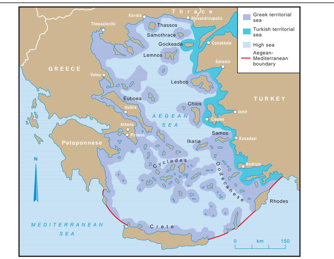
Map1: Present distribution of territorial seas in the Aegean (6 nautical miles)