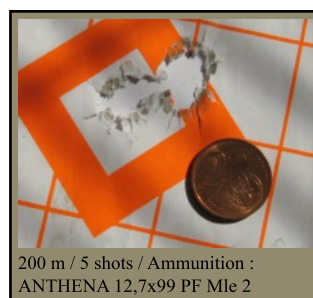
200 m / 5 shots / Ammunition : ANTHENA 12,7x99 PF Mle 2