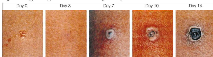
Figure 4. Typical Appearance of an Evolving Primary Vaccination Take

3