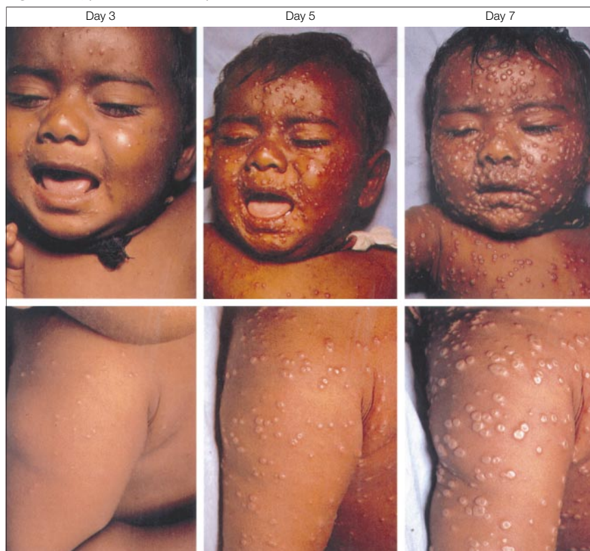
Figure 2. Typical Case of Smallpox Infection in a Child

Figure shows the appearance of the rash at days 3, 5, and 7 of evolution. Note that lesions are more dense on the face and extremities than on the trunk; that they appear on the palms of the hand; and that they are similar in appearance to each other. If this were a case of chickenpox, one would expect to see, in any area, macules, papules, pustules, and lesions with scabs. 2