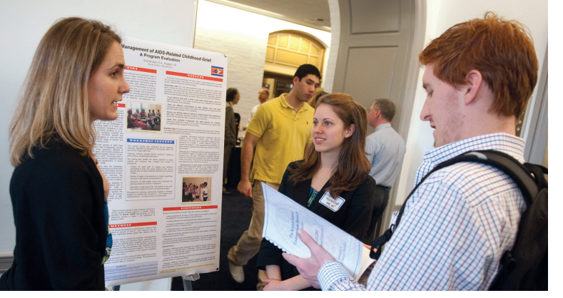
Undergraduate students present the results of their research projects.