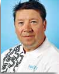
JARI KURRI GENERAL MANAGER