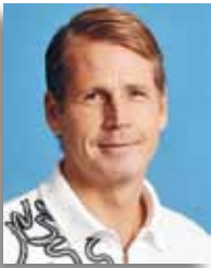
JAMMU ÖYNAP PHYSICIAN