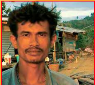
Along with many others, this young Burmese refugee in Thailand sought help after the tsunami.

“My nickname is ‘Sunny Boy’ because I laugh and smile most of the time. But I cried that evening. Not about losing everything. I cried because help had finally come.”