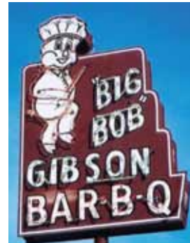
Big Bob Gibson, Decatur

Daphne Shrimp Po-Boy at Market By The Bay , 251-621-9994