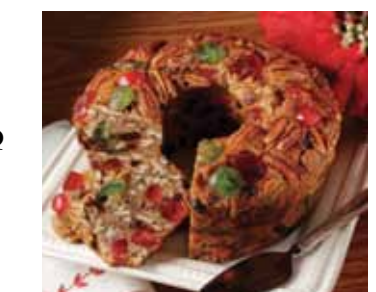
Priester's, Fort Deposit