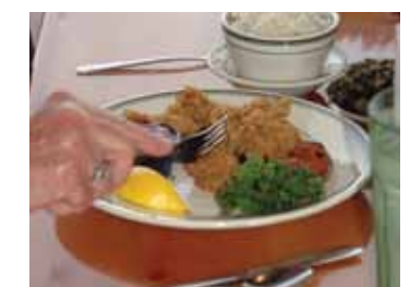
Original Oyster House, Gulf Shores