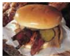
Bob Sykes BarB-Q, Bessemer

Birmingham Buttermilk fried chicken with lemon basil sauce at Cafe Dupont , 205-322-1282 Cheese biscuits at Jim 'n Nick's Bar-B-Q , 205-320-1060 Gourmet pizza at Cosmo's , 205-930-9971 "Half-Moon Cookies" & marinated cole slaw at Full Moon Bar-B-Que , 205-324-1007 Hamburger & sweet tea at Milo's , 205-326-6456 Highlands baked grits at Highlands Bar & Grill , 205-939-1400 "Honey's Pies" at Baby Ray's , 205-945-7437 ● Hot dog at Pete's Famous Hot Dogs (1915), 205-252-2905 Lobster Pot Pie at Ocean , 205-933-0999 ● Onion rings at Lloyd's (1937), 205-991-5530 Neopolitan pizzas at Bettola , 205-731-6499 Parmesan souffle at Bottega , 205-939-1000 Pastries at Chez Fonfon , 205-939-3221 Tomato salad & pickled okra at Hot and Hot Fish Club , 205-933-5474 Vegetable buffet at Niki's West , 205-252-5751 Vine-ripe tomatoes with Parmesan flan at Fire , 205-802-1410