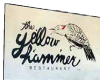
Yellow Hammer, Waverly

Baked Turkey Wings at Larkin's Deli , 205-932-9988