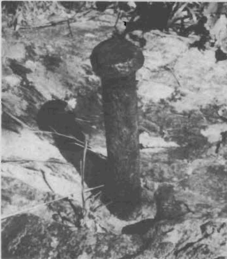
Iron peg is all that is left of the Snake Castle headgate.

The Rappahannock Company had its own problems, as well: the project was under-capitalized and burdened with debt, the design was poor, and the river uncooperative. Far too little money was set aside for maintenance and repair.