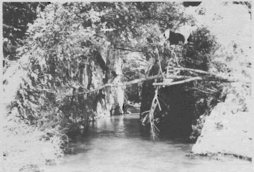
Snake Castle, a large rock formation, was at the north end of the dam built for Ellis' Mill Canal, one of two built to bypass the rapids there. The natural cleft probably held the headgates of the canal.