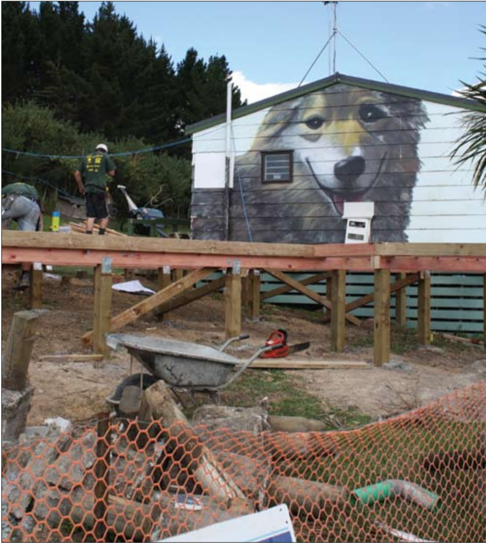
NEW RECEPTION: Work under way on foundations at the dog pound.

Long-awaited changes to Whangarei's dog pound are due to be completed within three months.