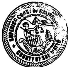
JUDGE OF THE SUPERIOR COURT County of San Mateo, State of California